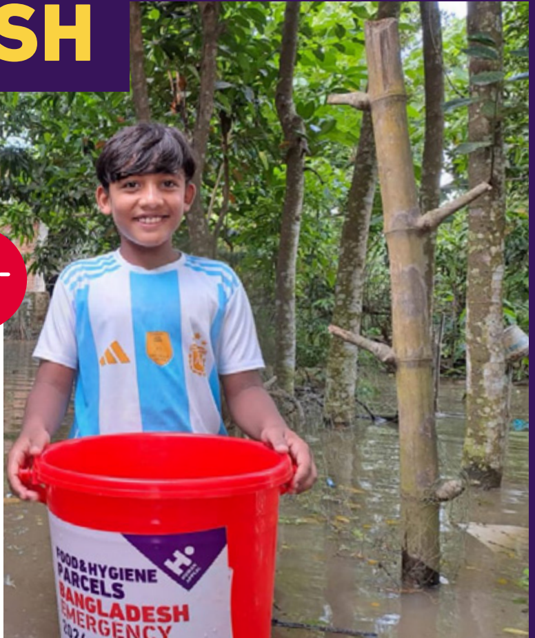
Bangladeshi child holding the emergency kit provided by Human Appeal.

Following the floods that struck Bangladesh, Human Appeal immediately acted to support 200 flood-affected families in the Cumilla district, providing them with emergency survival kits. These kits included staple foods like rice and lentils, as well as hygiene items such as soap and towels, in quantities sufficient to last 2–3 weeks.