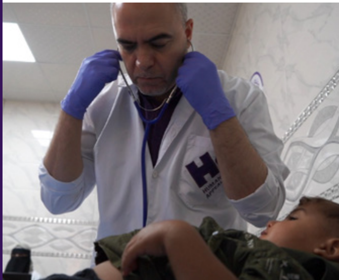
Child being examined at Al Imaan.

Al Imaan Hospital in Sarmada provided medical care to 12,245 people over the last month, and delivered 394 children, performing 99 C-sections.