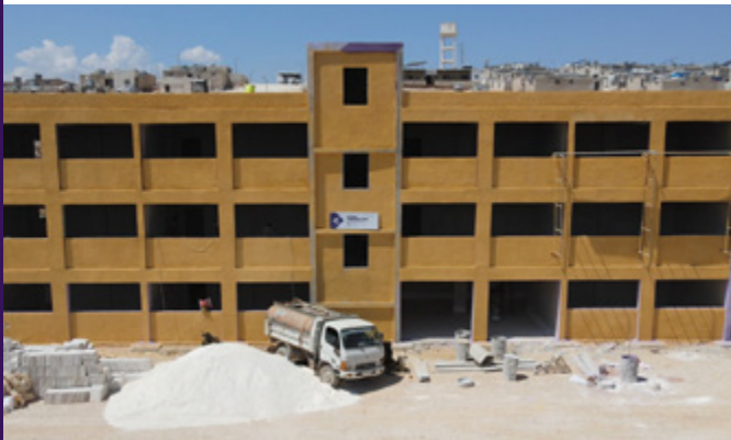
Plastering underway at Al Zohoor school.

After finishing construction on the third floor of Al Zohoor's school, our team has plastered the wall and floors and painted the outside of the building, aiming to complete the building before the start of the new school year. This school will provide a educational centre for local children who otherwise struggle to access education due distance and lack of transportation.