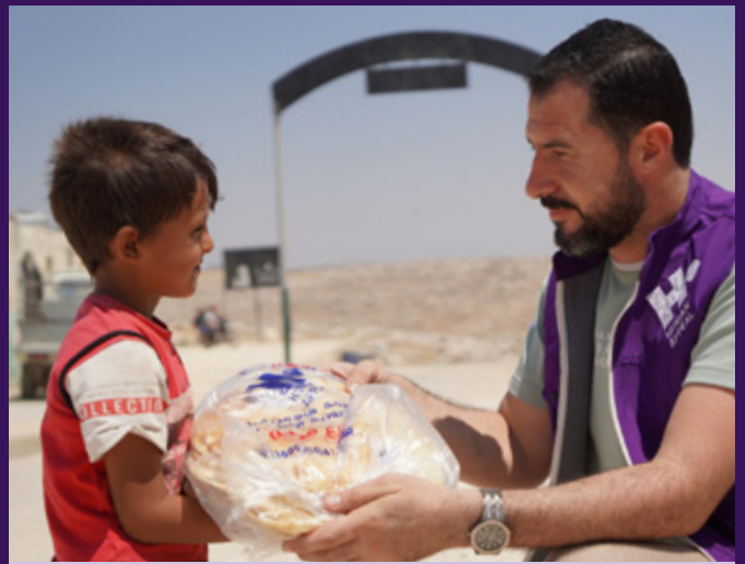
Bread bundles distributed in Syria.

The Human Appeal team worked to minimise the spread of scabies in Al-Furqan camp by raising awareness about hygiene, diagnosis, treatment, and prevention, while also distributing hygiene kits to 125 families.