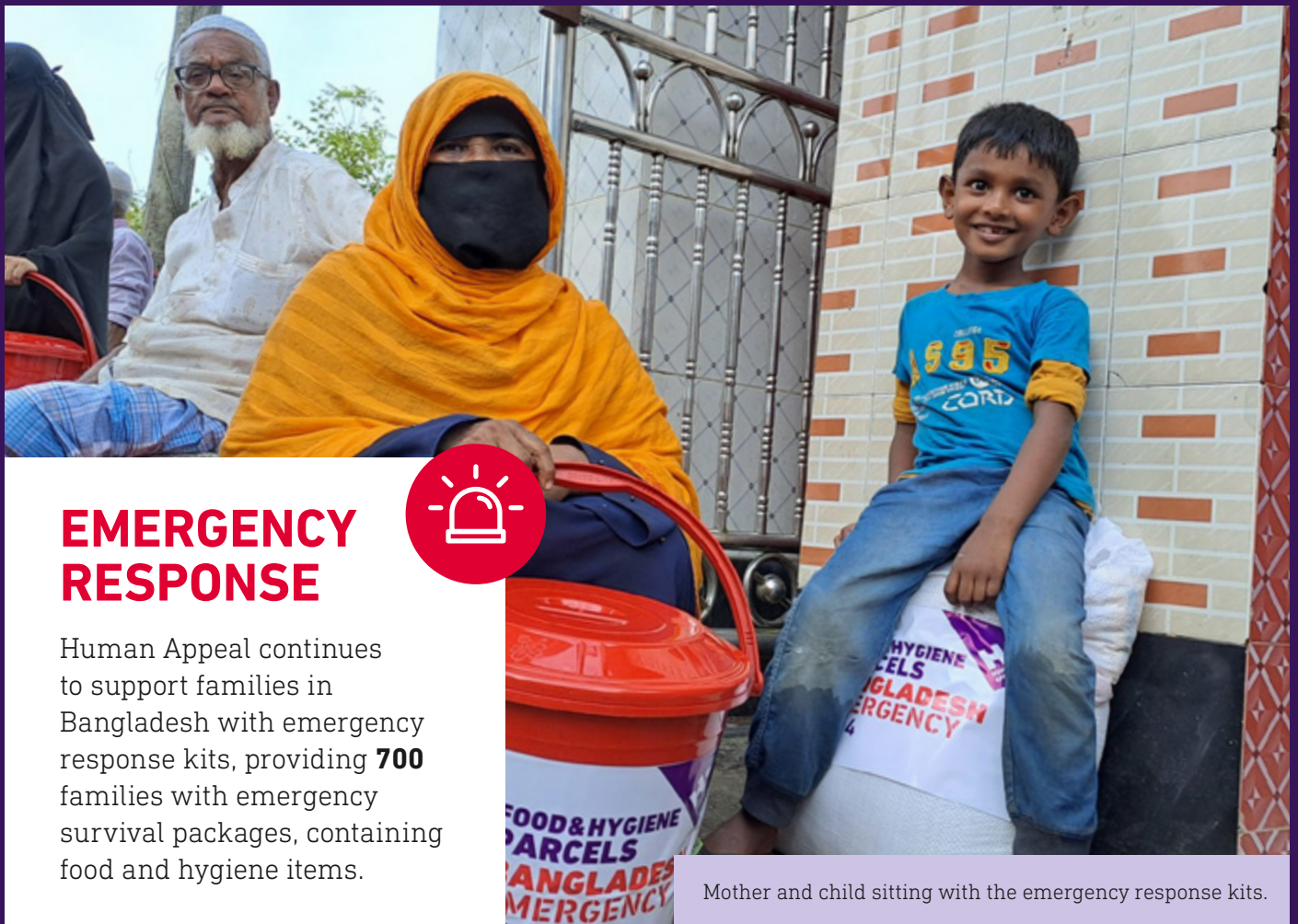
Mother and child sitting with the emergency response kits.

Human Appeal continues to support families in Bangladesh with emergency response kits, providing 700 families with emergency survival packages, containing food and hygiene items.