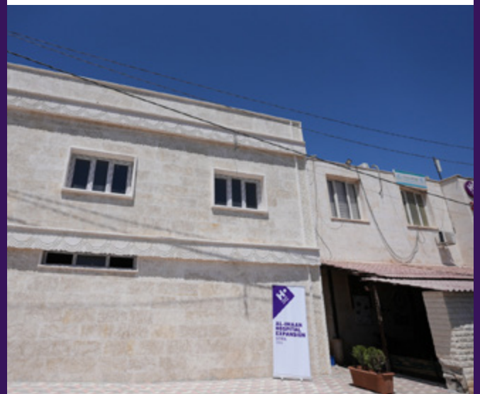
Al Imaan's newly built wings.

Human Appeal has completed the construction of two additional wings at Al Imaan Hospital, expanding its capacity to better meet the monthly needs of the surrounding displaced population.