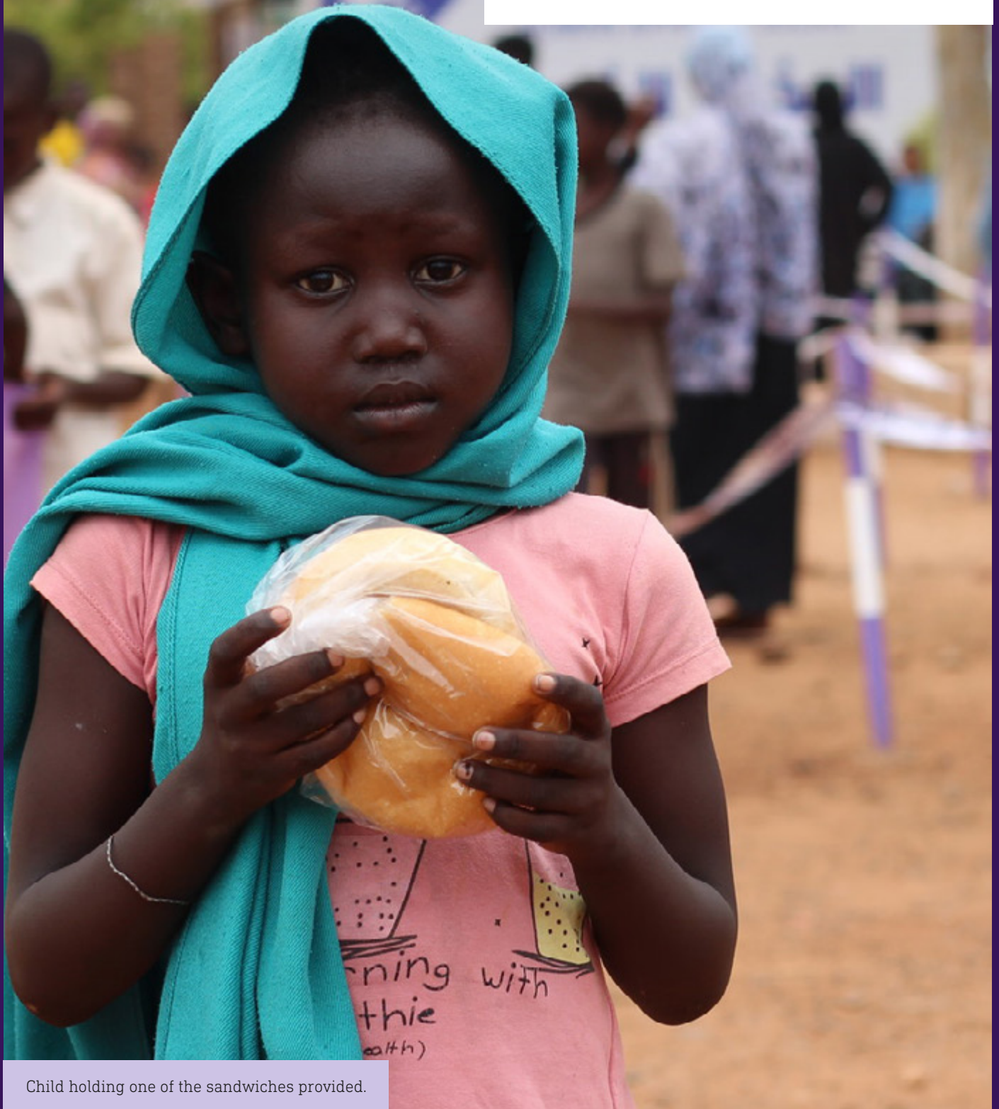
Child holding one of the sandwiches provided.

Human Appeal is providing daily hot meals to thousands of displaced people in Omdurman city and the Kharri locality. Additionally, we are delivering 100 meals to patients at Alnow Hospital and 200 sandwiches to 100 family members of those patients.