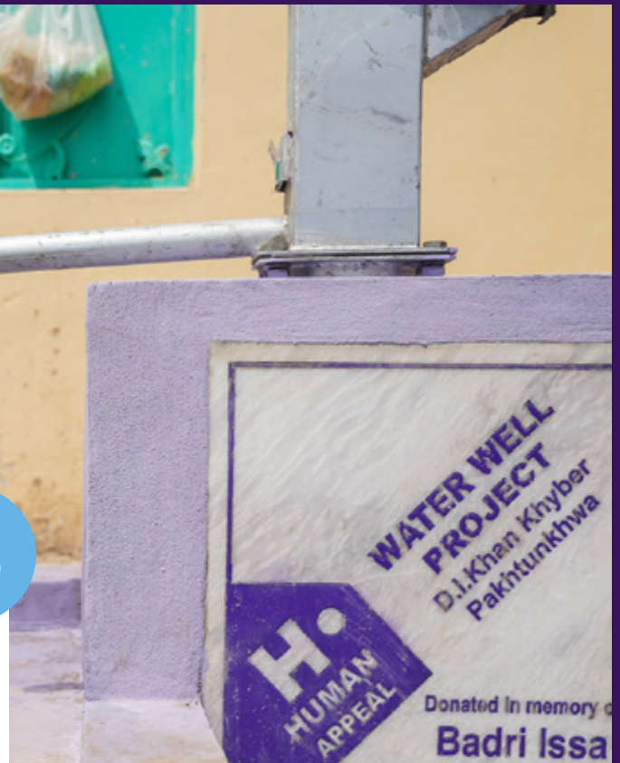
Child sitting by one of the newly built water wells.

We established seven water wells in Dera Ismail Khan, positioning them in the centre of their respective communities, ensuring they can have access to clean and safe water.