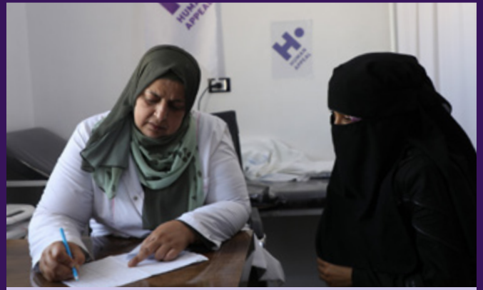
Prescription being written at Al Zohoor Health Centre.

The mobile clinic operating in Syria provided medical care to 1,619 people over the month of July, providing free examinations, treatment and medicine.