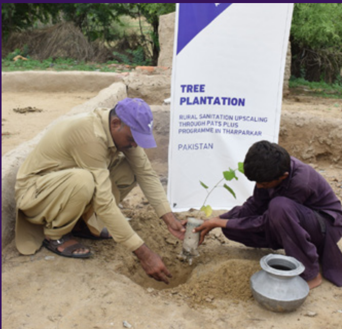
Tree saplings being planted in Pakistan.