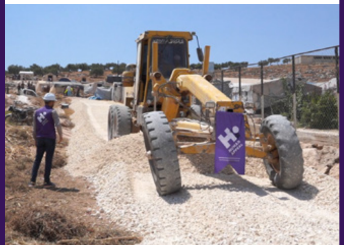
Road to Al Sheikh Bahr camp being flattened.

Human Appeal conducts periodic maintenance on seven displacement camps in Idlib, northwest Syria. This includes paving the road to Al Sheikh Bahr displacement camp and constructing bathroom blocks in several other camps.