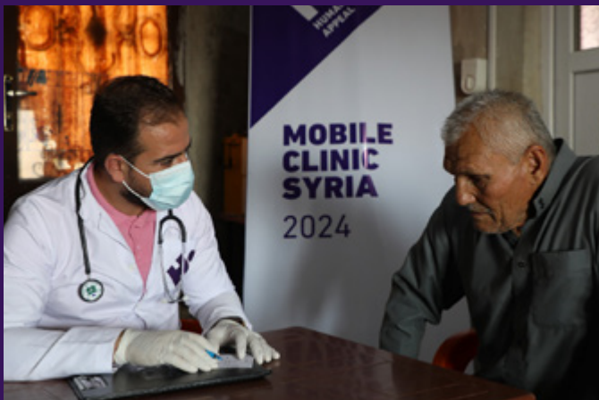
Doctor diagnosing a patient at the mobile clinic.