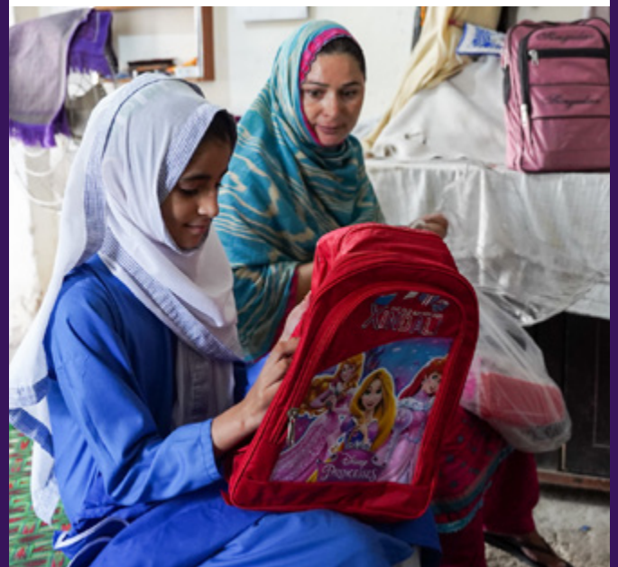
Young girl who has just received a new rucksack containing school supplies, as well as a new uniform and shoes.

Human Appeal has supported over 100 orphan children in the district of Rawalpindi by providing them with new school uniforms and supplies to encourage and support their education.