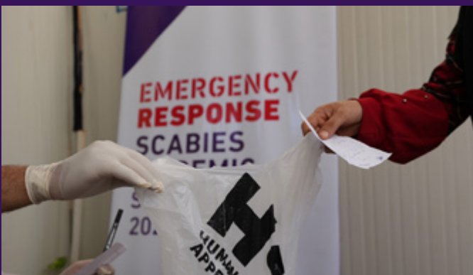
Medicine for scabies being provided via a mobile clinic.