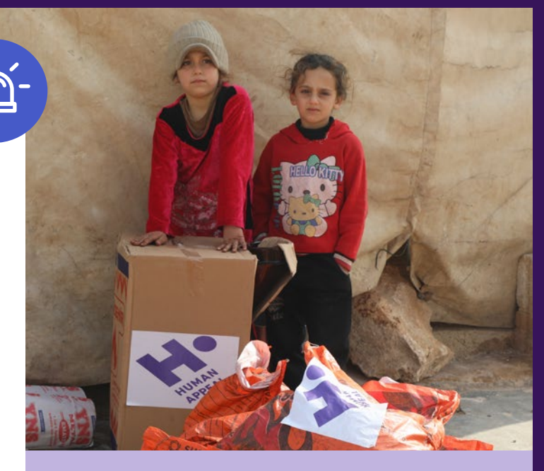
This month, we distributed heating materials to vulnerable Syrian families living in Al Nahda camp.

In January, our team in Syria distributed a heater and 175kgs of coal to 905 displaced families living in makeshift camps in northwest Syria. We also provided 641 families in Al Muhajarin camp affected by storms with a carpet, 2 blankets, 2 mattresses, and plastic sheeting to reinforce their shelters. In Sarmada, we provided around 2,500 families with a heater and 175kgs of coal.