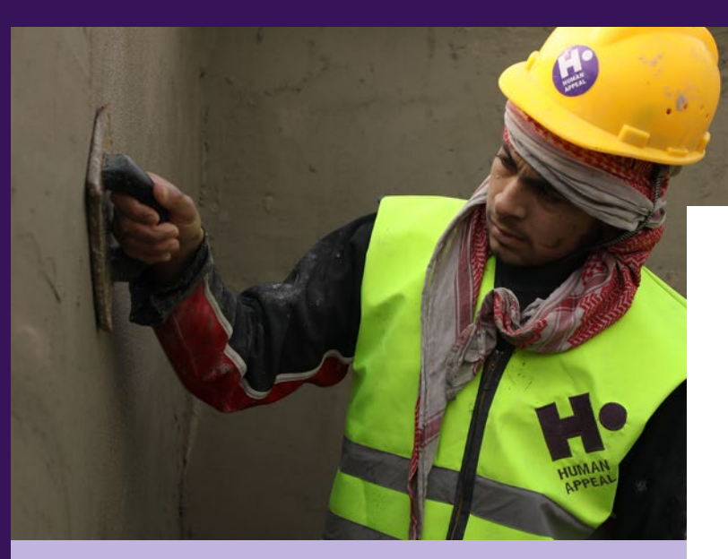
This month, we finished the first phase of constructing homes for Syrian families in Al Sadaqa camp!