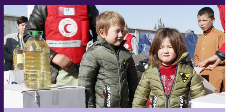
At the start of the year, we delivered your winter donations to vulnerable families in Afghanistan.