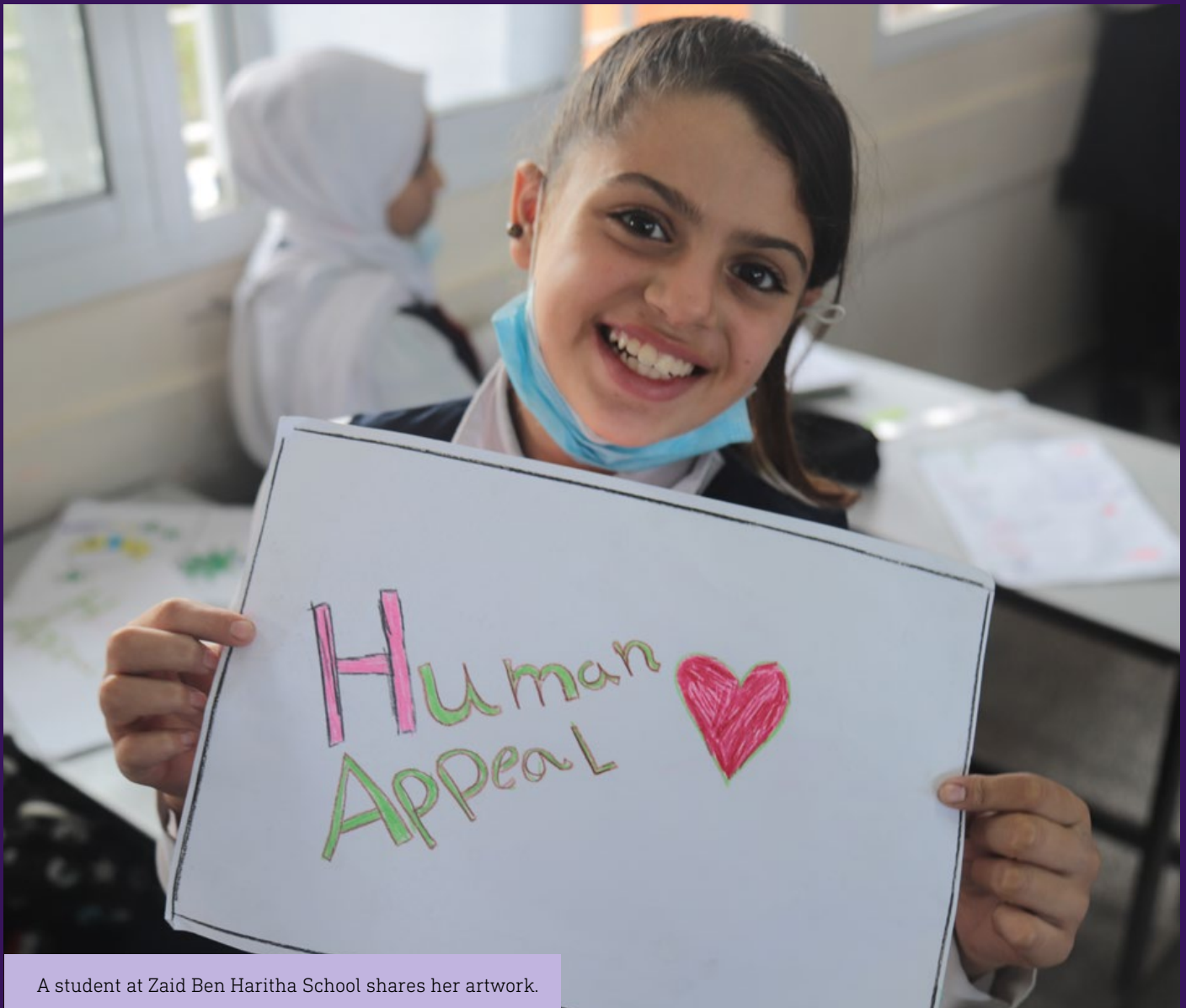
A student at Zaid Ben Haritha School shares her artwork.

We distributed your orphan sponsorship funds this September, to coincide with the start of the school year, helping families to buy essential supplies for learning.