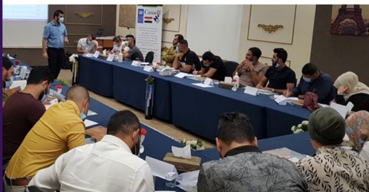
Young entrepreneurs engaging in the training programme in Ninewa and Kirkuk.

We provided 240 young entrepreneurs in Ninewa and Kirkuk with training on six management practices to help them expand and innovate in their business acumen. Once complete, they'll pitch business proposals and we'll provide 200 of them with funding to help them launch their businesses.