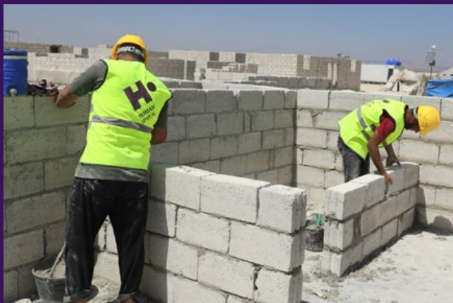
88 permanent homes built before the arrival of winter.