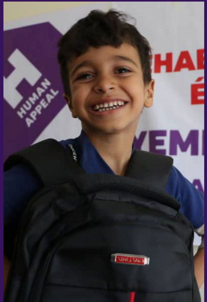
A schoolboy in Al-Sanahef – Mashra'a and Hadnan District, Taiz governorate, Yemen, receives his schoolbag.

Coinciding with the start of the school year, we distributed school bags to children in Al-Sanahef – Mashra'a and Hadnan District, Taiz governorate, Yemen, helping them to stay in school and develop the skills for a brighter future.