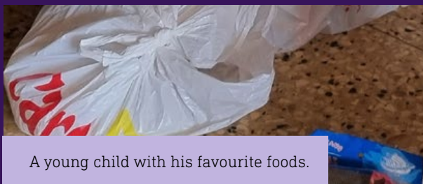
A young child with his favourite foods.