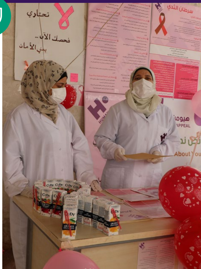
Celebrating Breast Cancer Awareness Month at Al Imaan Hospital in Syria.

Our nutrition team in Syria visited camps for displaced families, providing medical check-ups and nutritional supplements to children and women with malnutrition. They also provided medical referrals to our specialist centres to people with acute malnutrition.