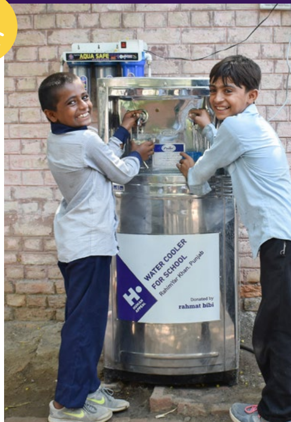
Two schoolboys collect water from our water cooler in Rahim Yar, Pakistan.