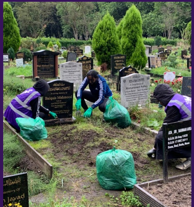
Our team of volunteers at cleaning up Southern Cemetery in Manchester.

In Glasgow, our volunteers cleaned the streets in Pollokshields, removing litter in an initiative that will soon become a regular occurrence. They also delivered 1,160 leaflets publicising our Wrap Up campaign in Glasgow.