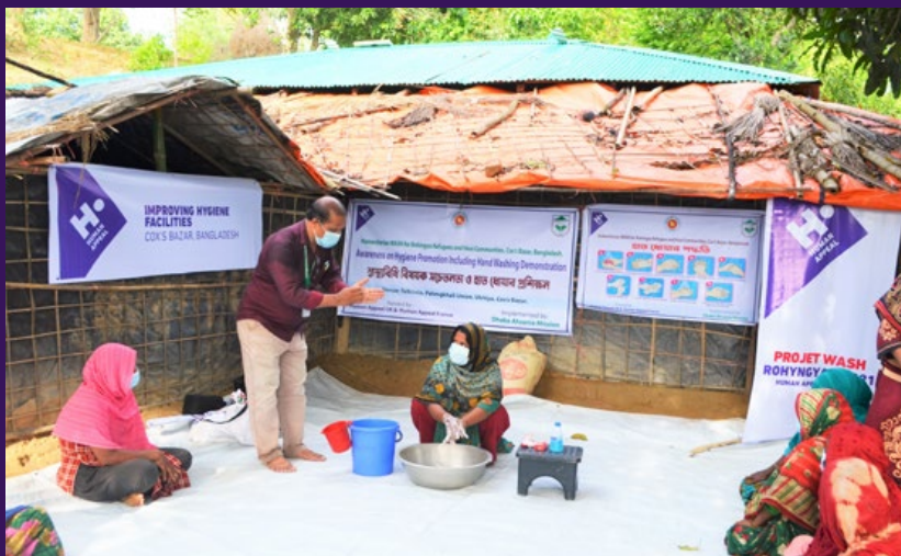
Delivering hygiene awareness sessions for the local community.