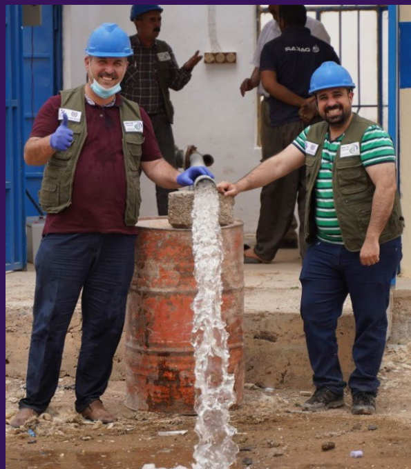
Delivering the gift of clean water in Iraq.