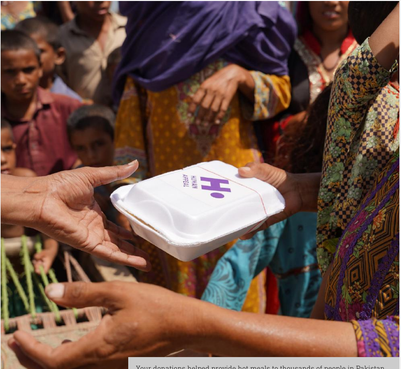
Your donations helped provide hot meals to thousands of people in Pakistan.

Since 2016, Human Appeal Pakistan has been transforming local communities, through life-saving aid, emergency, assistance, and programmes that support uplifting households out of poverty.