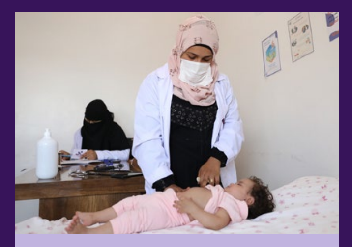
A medical professional examines a child to check their health and advise the family on what to do.