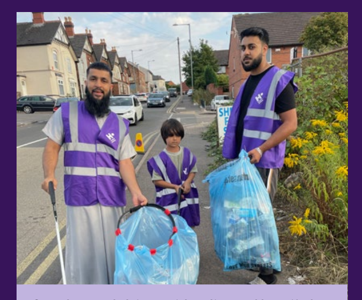
Our volunteers helping to pick up litter and beautify the area of Alum Rock.