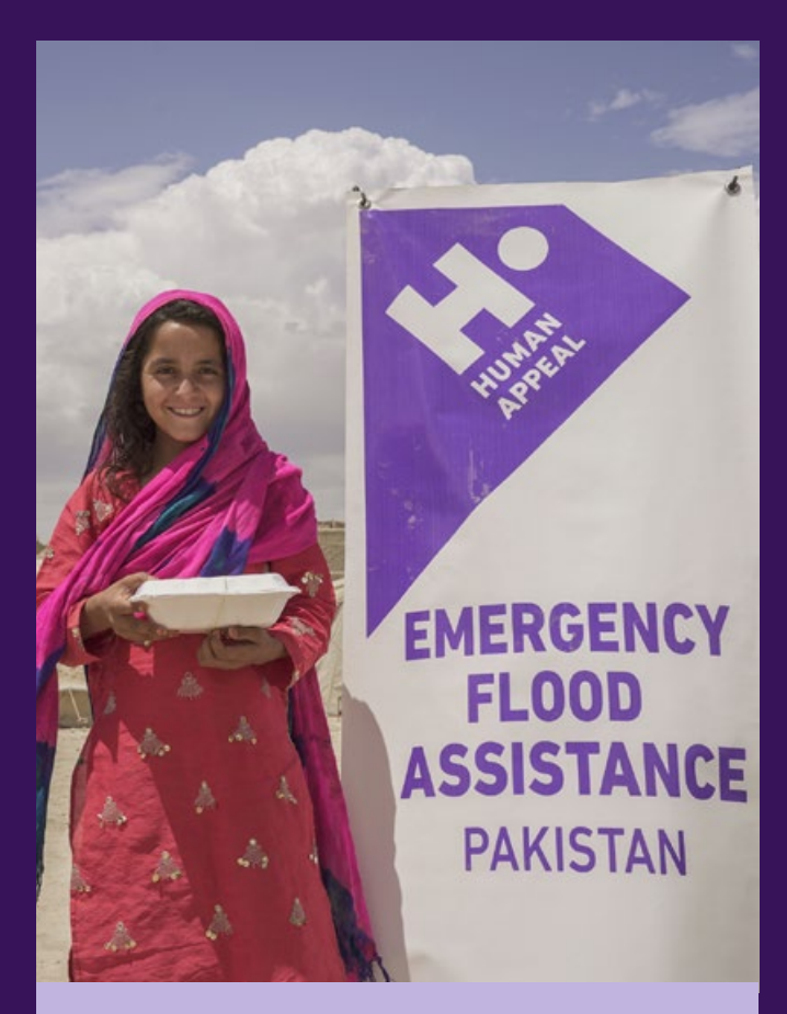
Balochistan was one of the worst affected regions by the flood, so Human Appeal distributed 300 hot meals to villages across the region.

To keep people in a healthy state, Human Appeal also distributed over 350 hygiene kits to help prevent the spread of disease even as people concentrate together for safety on dry land. We are aiming to raise £10 million from both private and corporate donors to reach as many vulnerable people as possible in Pakistan's worst hit areas. With your generous support, we have been able to reach over 70,000 people so far.