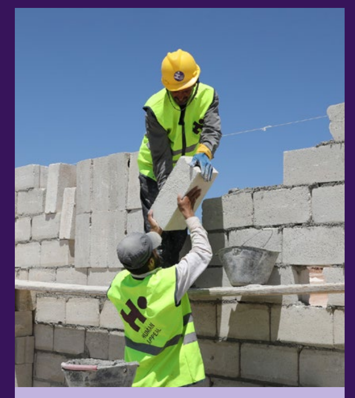
It is important to ensure displaced people have a secure and comfortable shelter to live in.