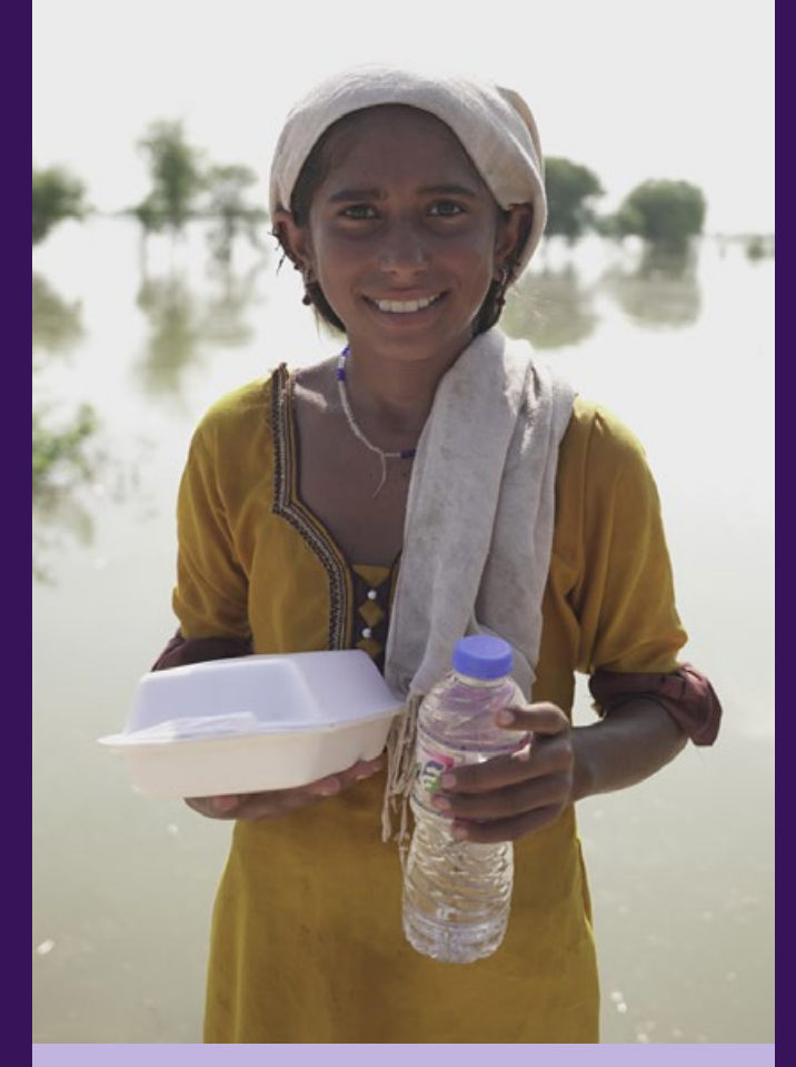
350 hot meals were distributed in Dadu in Charsadda along with clean, drinkable water.