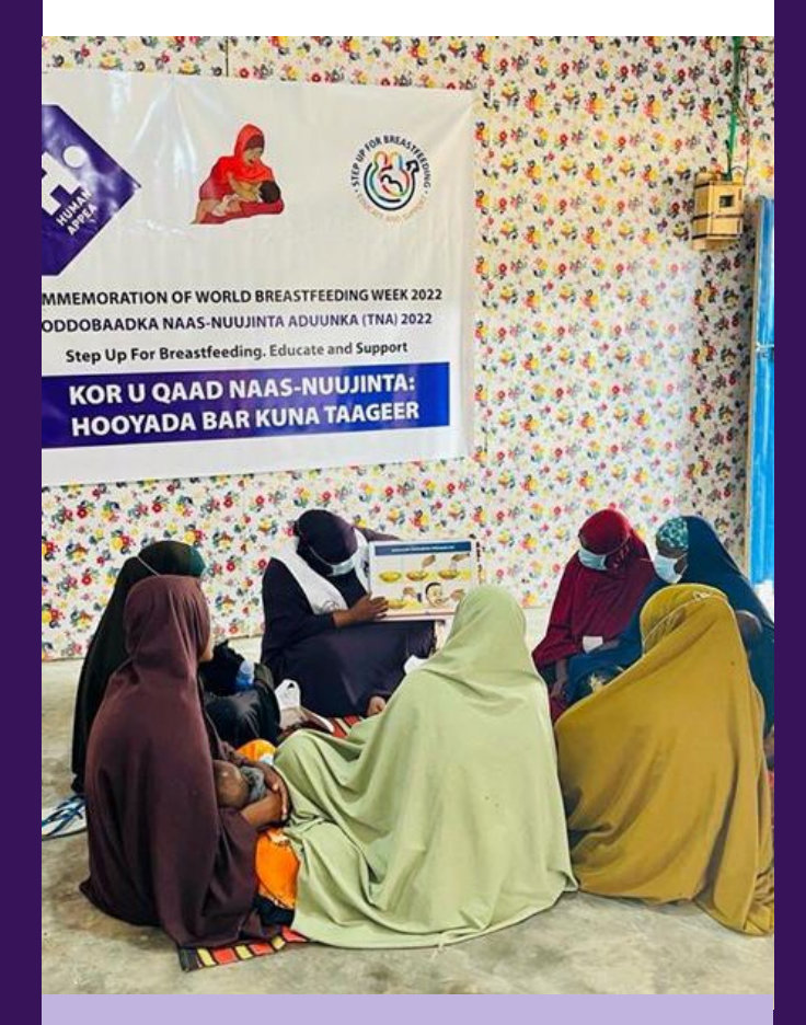
Breastfeeding is generally better for infants than bottled milk.

Our nutrition team held a workshop for displaced mothers on the importance of breastfeeding, to ensure as many children as possible have the best start to their lives.