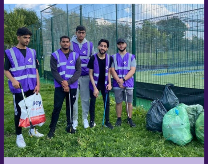
Our volunteers are constantly working to improve the communities around them.

Volunteers in Bradford and Glasgow provided community clean up.