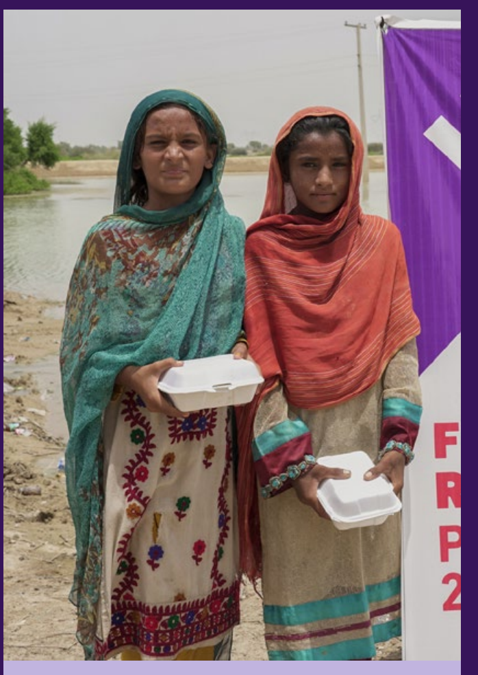
Human Appeal provides hot meals on an almost daily basis in Balochistan, Thatta and Rajanpur, all districts of Pakistan that were badly affected by the flooding.