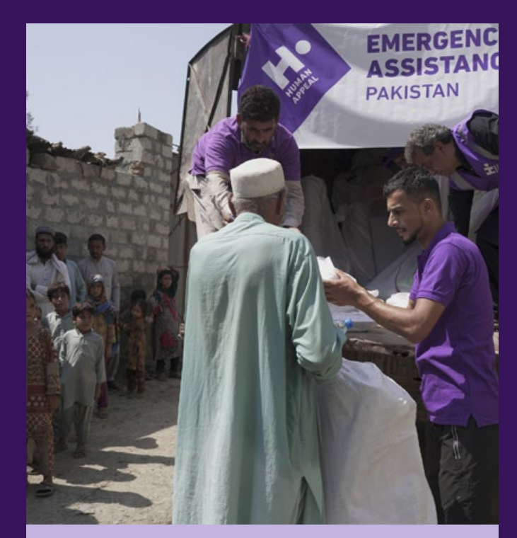
Over the course of a single day, Human Appeal was able to distribute hot meals, water and hygiene kits to 1,700 people in Pakistan.