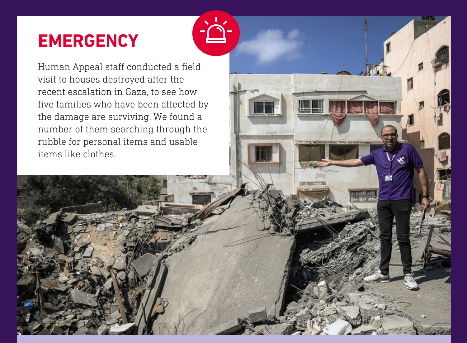
The devastation faced by the families whose homes were destroyed cannot be overstated.

Solar panels serve as a renewable energy source that makes people more resilient to power cuts that may occur.