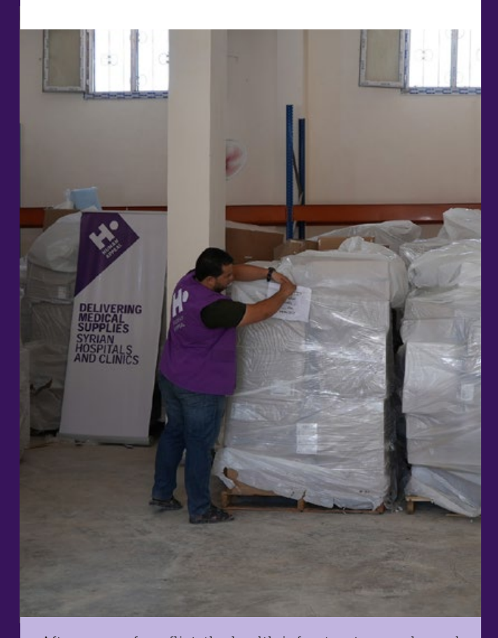
After years of conflict, the health infrastructure and supply networks of Syria have been heavily affected.

15 trucks of medical supplies were received from Globus Relief, to be organised and distributed by Human Appeal to hospitals and health facilities across northwest Syria.