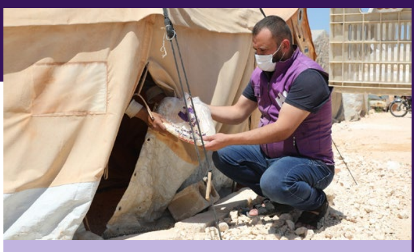
To displaced people, bread is an important, but often scarce, major staple food.

Human Appeal Syria distributed 34,100 bundles of bread to Syrians living in Kille, and 682 bundles to displaced Syrians living in Jabal Al Zaweya and Hama countryside.