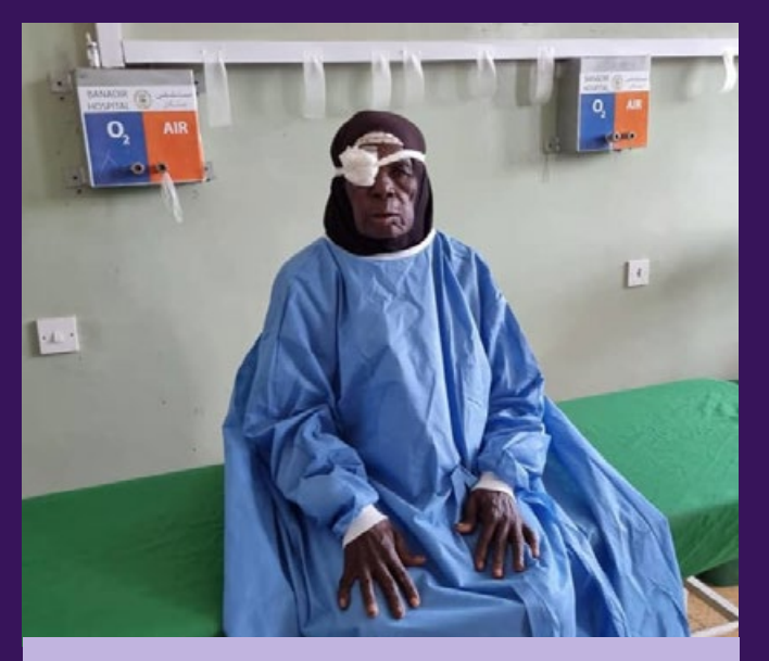
Cataract surgery is relatively inexpensive and easy.

A project has begun to provide cataract eye surgery and medicine to 500 people in displaced people in Mogadishu, and a further 500 in Baidoa.