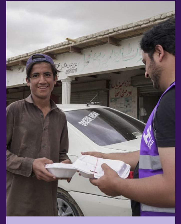
Human Appeal distributed an additional 350 hot meals and 350 hygiene kits in Balochistan, helping to keep people fed and healthy.