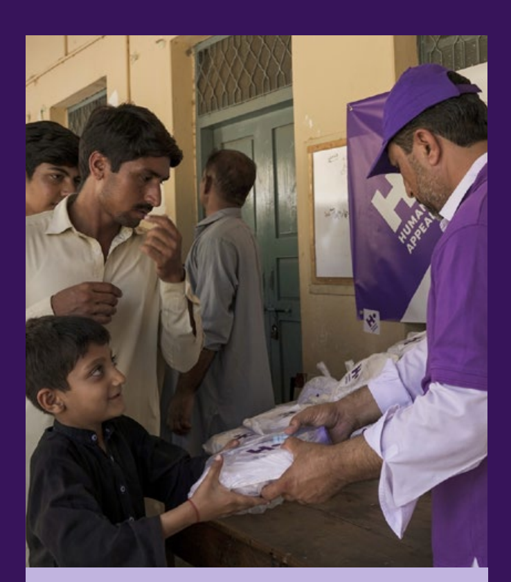
300 hot meals were distributed in the village of Geedar in Charsadda, helping buoy a population still in shock from the effects of the flooding.