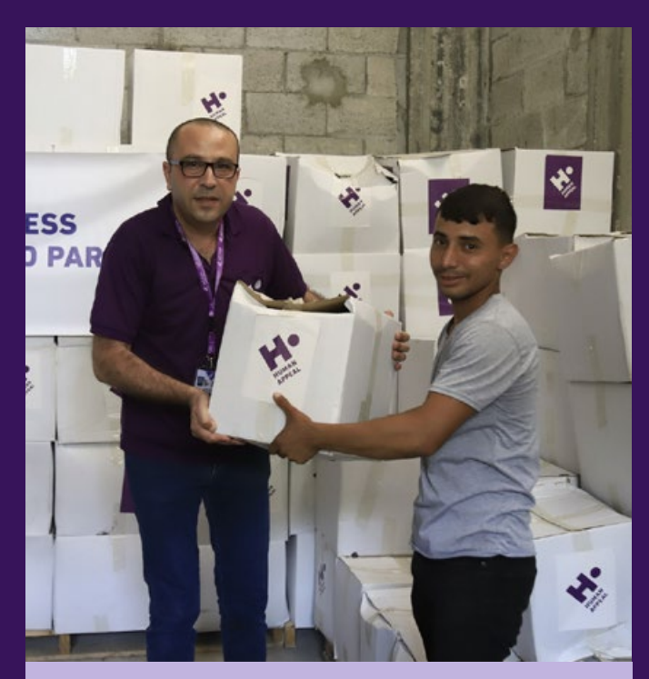
The most at risk families were targeted to ensure their health.