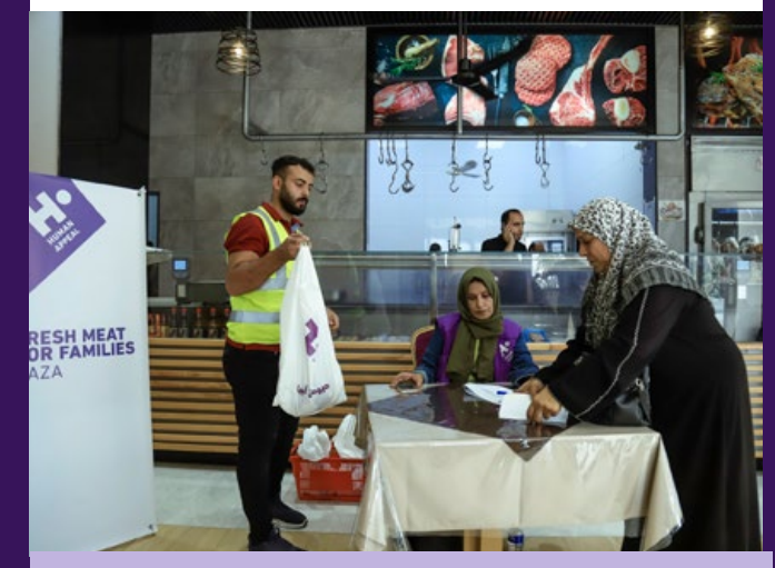
Fresh meat helps families eat nutritious meals.

Human Appeal provided fresh meat to approximately 50 vulnerable families in Gaza. Each family was provided with 2.5kg of meat , allowing them to enjoy a fulfilling and nutritious meal.