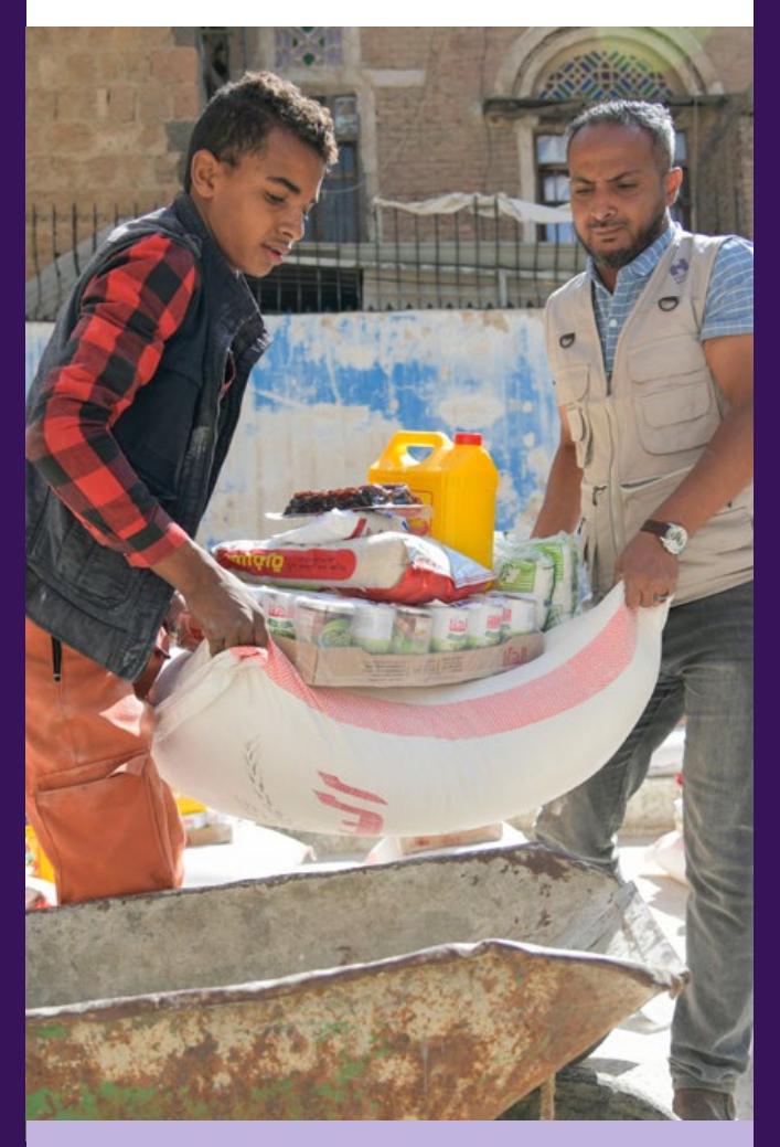
Food parcels give staple foods to help families.

We distributed 700 food parcels to visually impaired Yemenis in Sana'a, ensuring they would have nutritious food for a month.