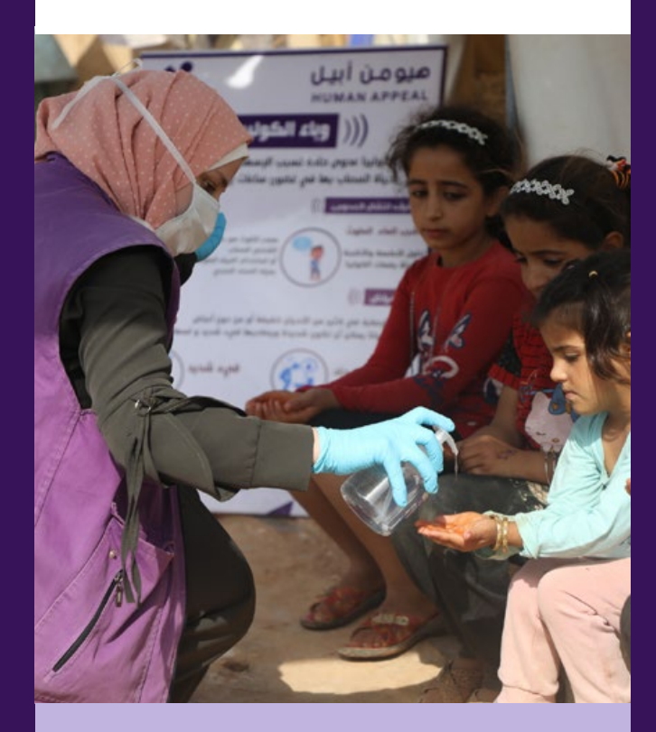
Sanitisers help prevent the spread of disease in camps.

Syria is experiencing its first cholera outbreak in 15 years. In response, Human Appeal's field team visited displacement camps in the areas of Sarmada and Killi to provide awareness and information on cholera and methods to prevent it, including distributing hand sanitisers in the Killi camps.