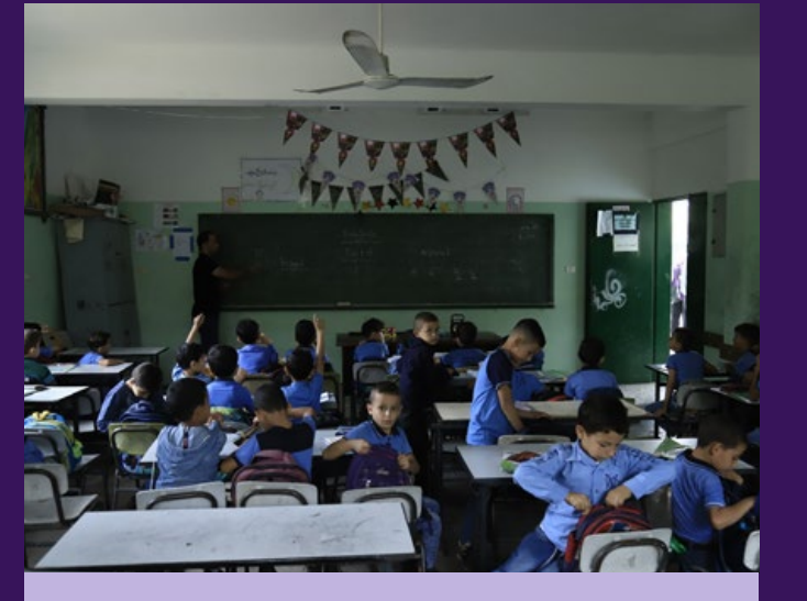
Schools in Gaza struggle to retain power.

Human Appeal, with the support of Human Appeal Spain, organised a party for 78 orphan children in Gaza. In addition to a variety of fun activities, each child also received a cash gift.