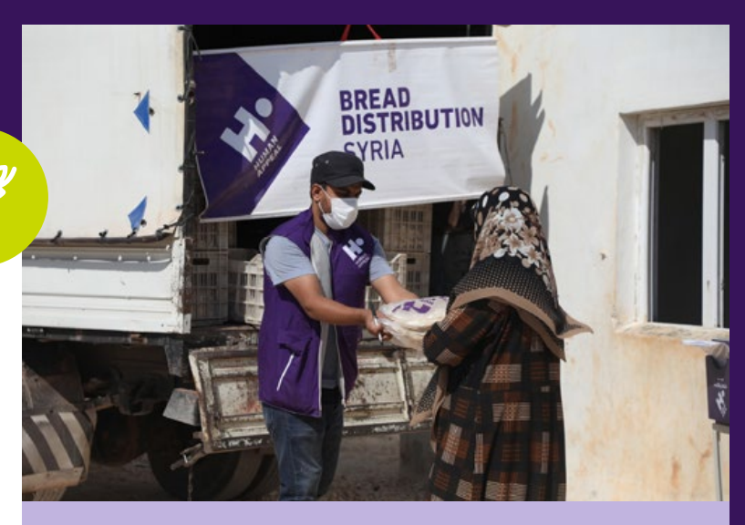
Bread distribution continues to be a popular project in Syria.

Over the course of 103 days, the Human Appeal field team has distributed 70,246 bundles of bread in the Heish extension of the Killi community in Idlib, distributing 682 bundles each day.