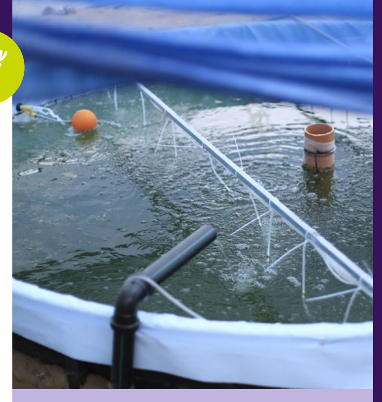
Aquaponics will help Palestinians agricultural efforts.

We're supporting 120 agronomy students with nexgen agriculture techniques to create sustainable livelihoods in Gaza, where the blockade and water scarcity have made traditional farming incredibly difficult. Aquaponics reduces the water requirements for typical agricultural products by leveraging the natural symbiosis between plants and fish. This innovative farming practice equips vulnerable families in Gaza with the skills needed to profitably grow food to feed themselves and their families.