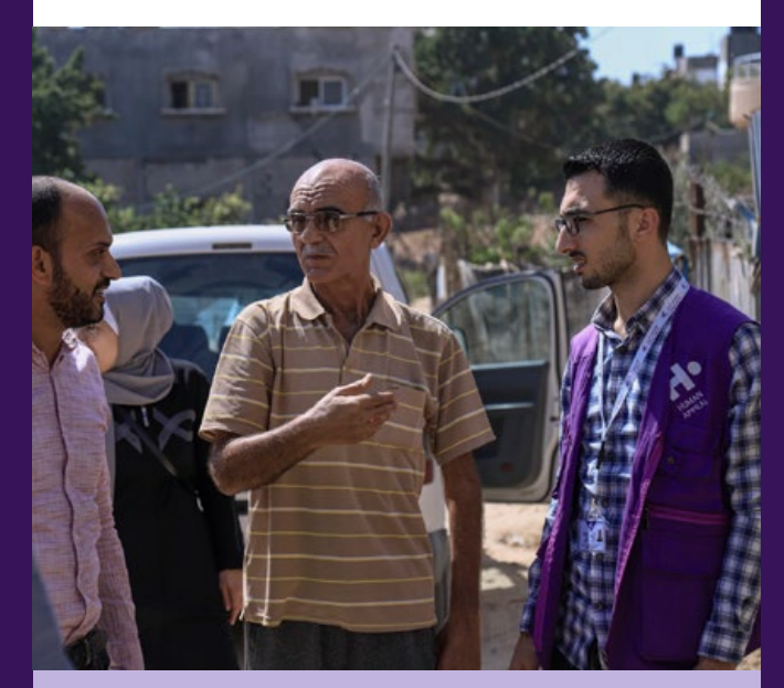
Consulting with locals is important before larger projects begin.

In preparation for a project to treat wastewater in the north of Gaza, our team visited the area to map it ahead of the project beginning.