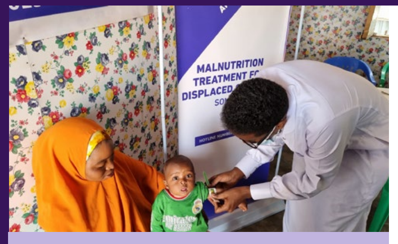
Human Appeal is combating malnutrition in Somalia.