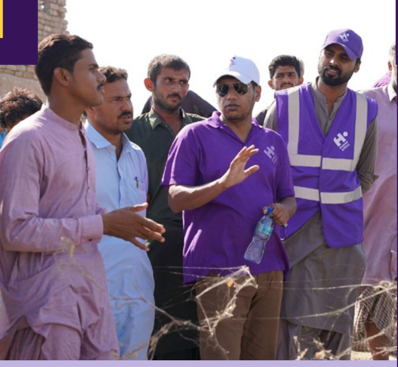
Conversation with residents to see what they need.

Human Appeal Pakistan team visited a flood-hit village in the Dadu District of Sindh, to assess the damage and determine the best ways to help meet survivors' needs. The team met with locals to discuss the planning for new home construction for residents who are now forced to live on the roads.