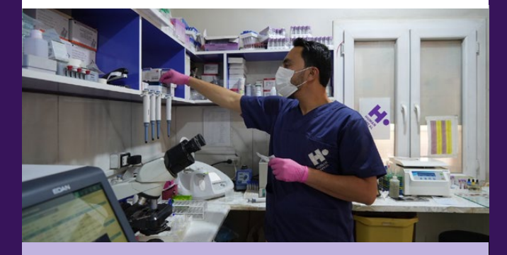
Medical work ongoing at Al Imaan Hospital.

In response to damage sustained during the February earthquakes, Al Imaan Hospital has been repaired and damaged areas have been rebuilt. In some of the areas that have been rebuilt, such as the incubator room, equipment has even been improved.