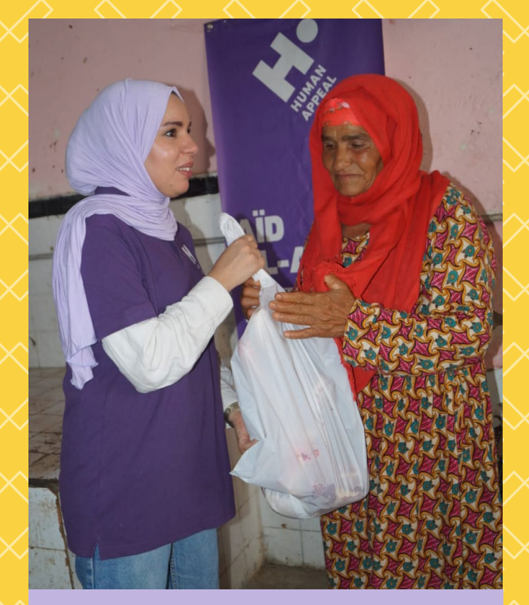
In Tunisia, our Qurbani programme helped 52,720 people with meat for their Eid meals.