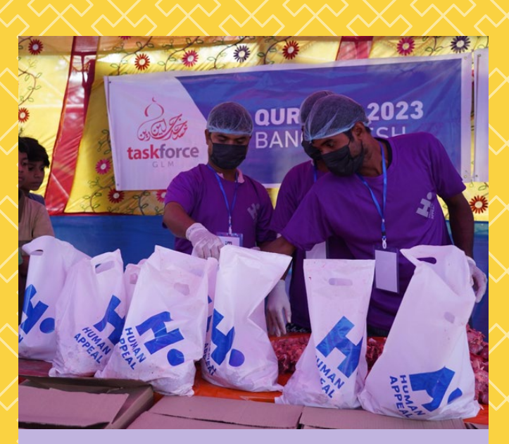
In Bangladesh, Human Appeal distributed Qurbani to 1,740 families, a total of 8,700 people .