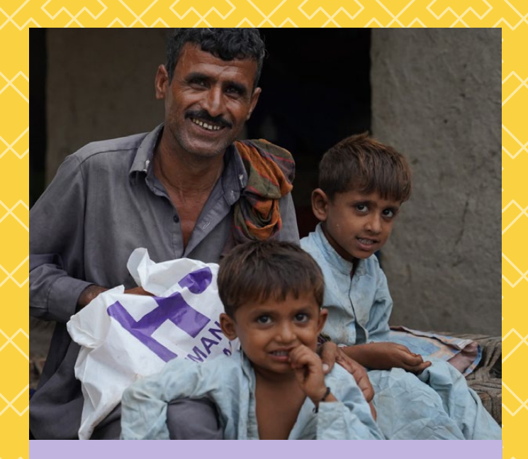
In Pakistan, we distributed 4,020 Qurbanis , each weighing 3kg , supporting 20,100 people .