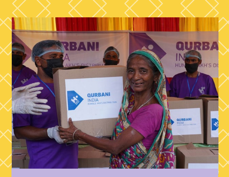
In India we helped provide 1,149,600 people with Qurbani, ensuring 229,920 families could enjoy an Eid meal.