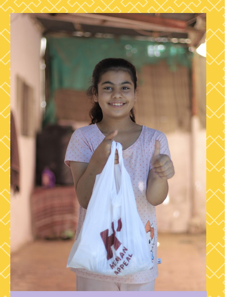
Human Appeal distributed portions of Qurbani meat to over 4,260 families living in the Gaza Strip.

In Yemen, we provided Qurbani meat parcels to 8,874 families , including the visually impaired, people suffering from renal failure, and orphans.