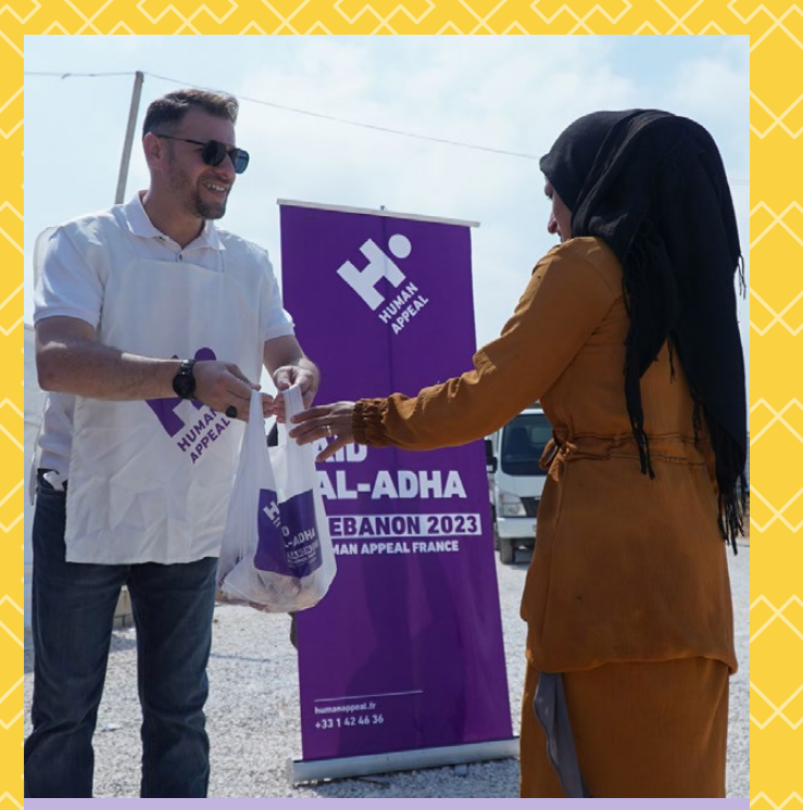
In Lebanon, Human Appeal distributed 1,860 Qurbani portions to Syrian, Palestinian and Lebanese families.