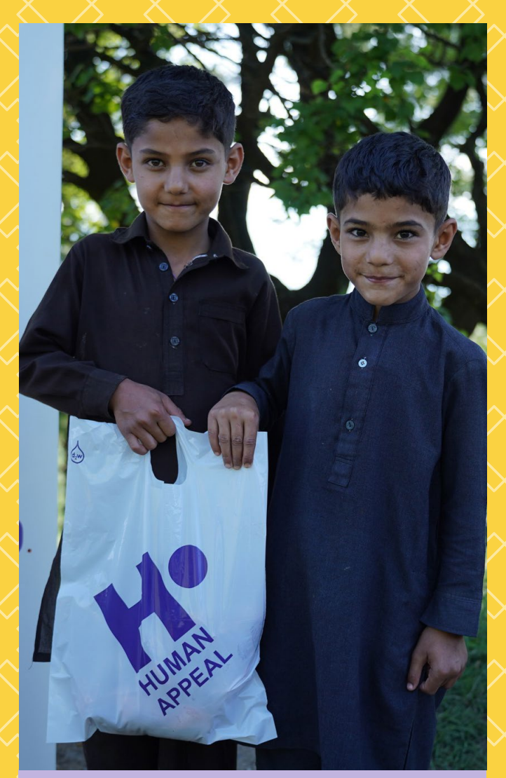
Human Appeal distributed 1,320 portions of beef in Pakistan-administered Kashmir, helping 6,600 people .