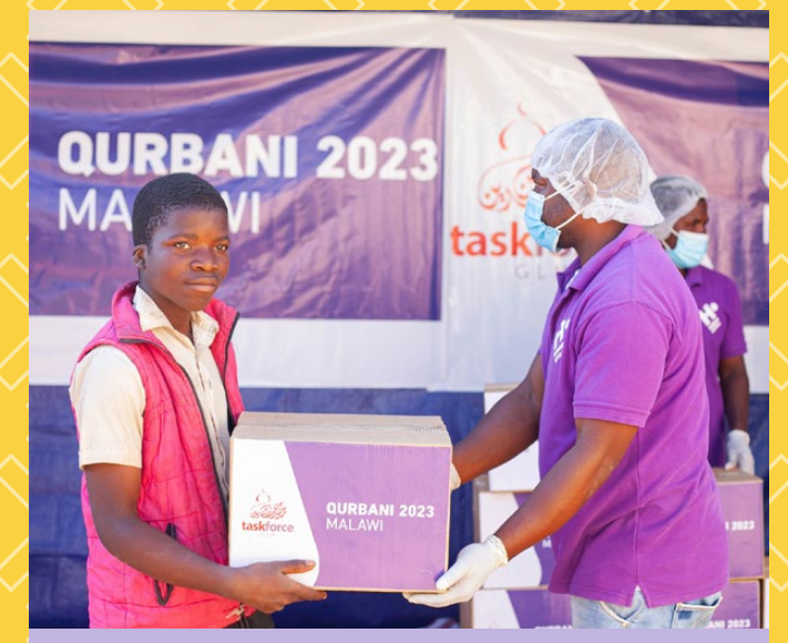
In Malawi, we distributed 19,648 portions of goat across 98,240 people .