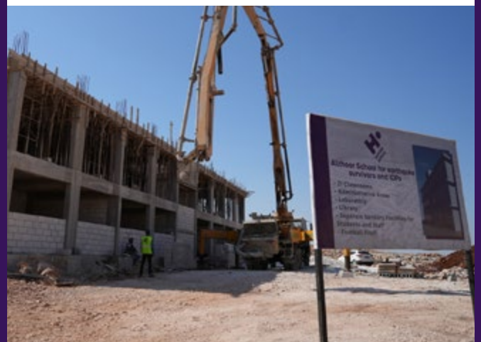
Construction underway at the Al Zohoor school.

The school in Al Zohoor Village is still under construction, with the second storey currently in progress. Once completed, it will feature multiple rooms and provide a safe, local environment for children to play, learn, and grow.