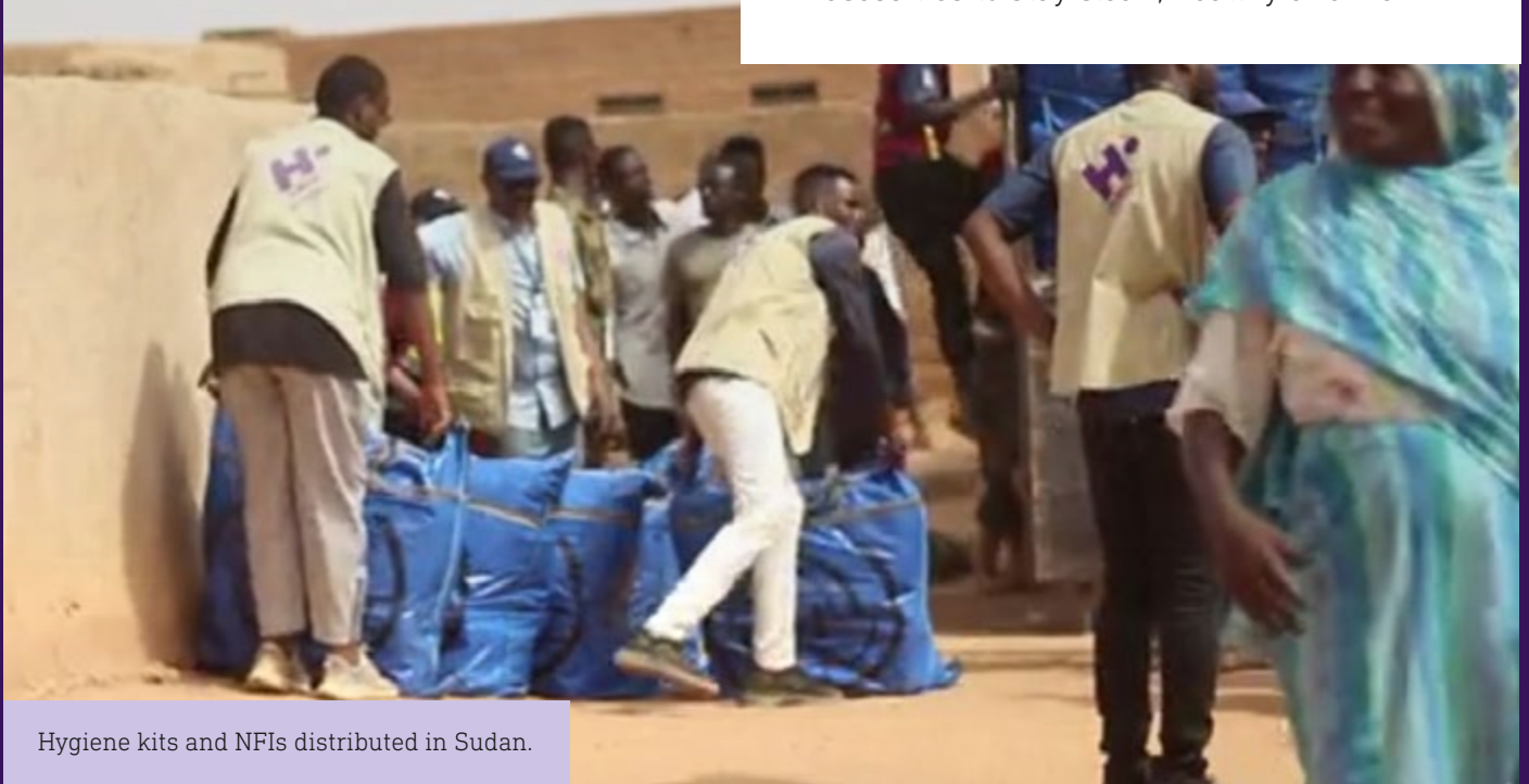
Hygiene kits and NFIs distributed in Sudan.

Our team in Sudan distributed non-food items and hygiene kits to vulnerable people in Sudan, providing them with basic necessities to stay clean, healthy and warm.