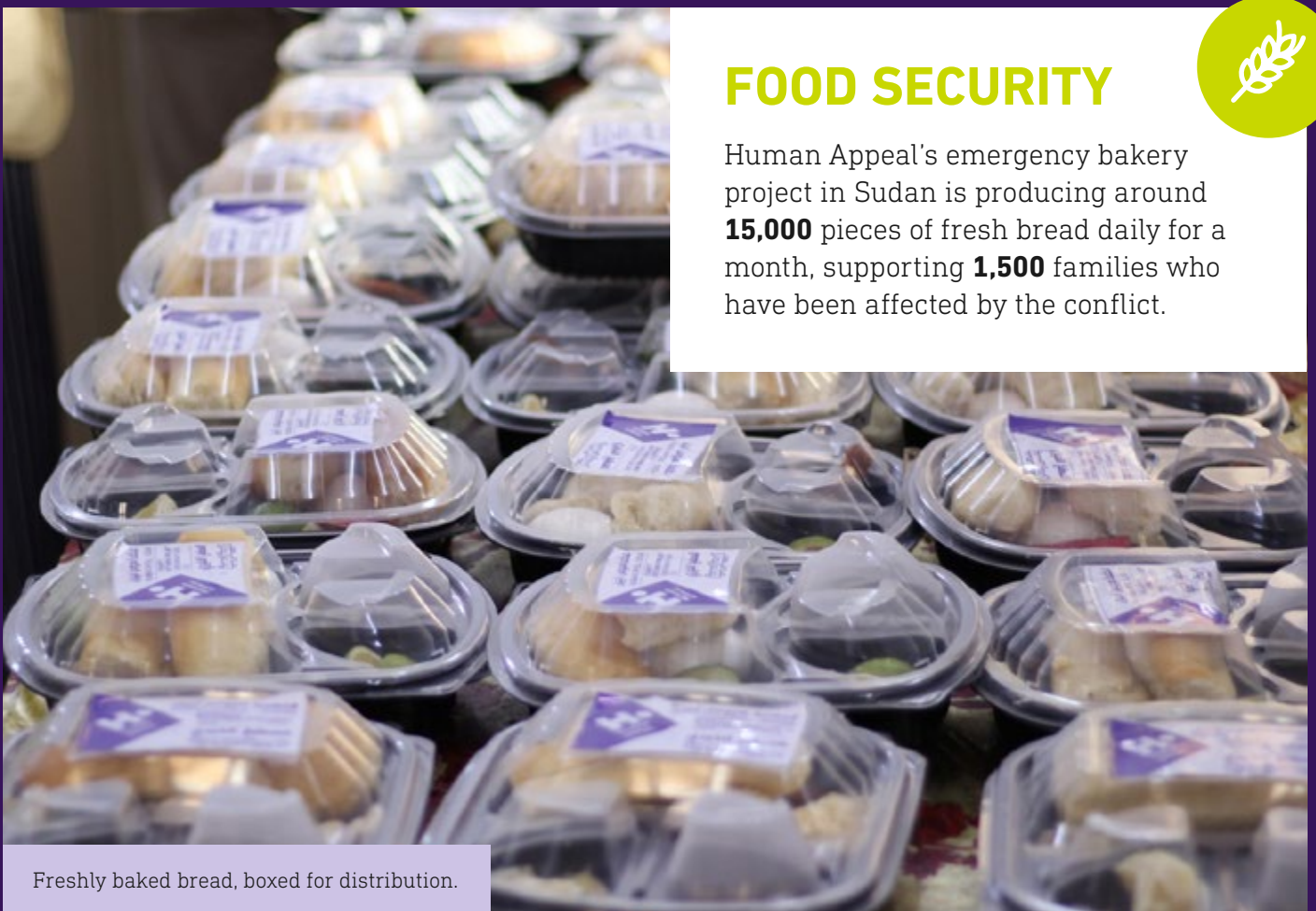
Freshly baked bread, boxed for distribution.

Human Appeal's emergency bakery project in Sudan is producing around 15,000 pieces of fresh bread daily for a month, supporting 1,500 families who have been affected by the conflict.