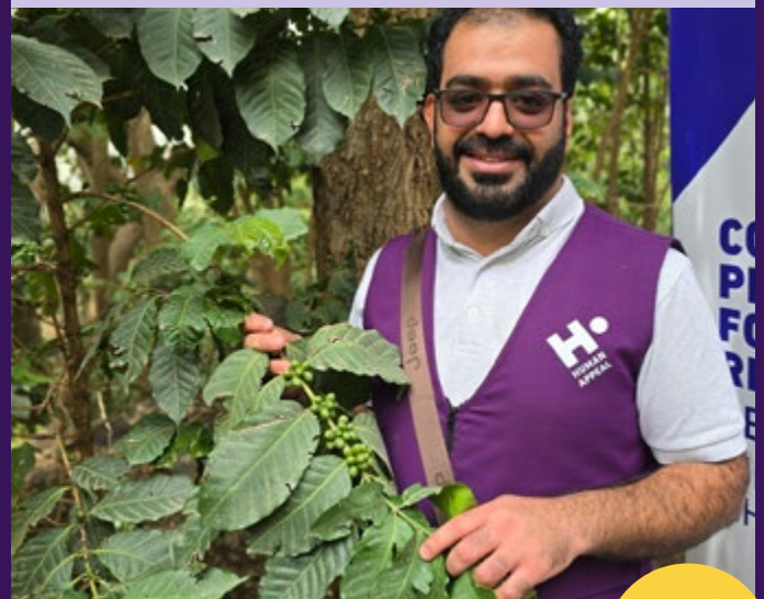
Human Appeal staff member with coffee tree.

Human Appeal provided 2,003 dialysis kits to the kidney dialysis center at Althawrah Hospital in Yemen, ensuring that 250 patients can each receive eight dialysis sessions over the course of a month.