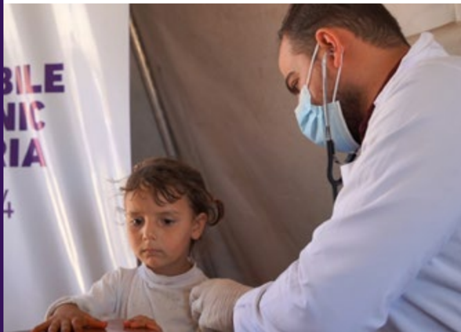
Child being examined at the mobile clinic.