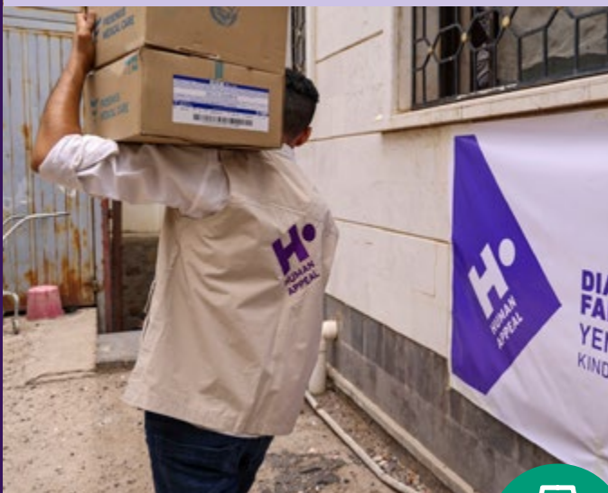
Dialysis kits being delivered to the hospital.