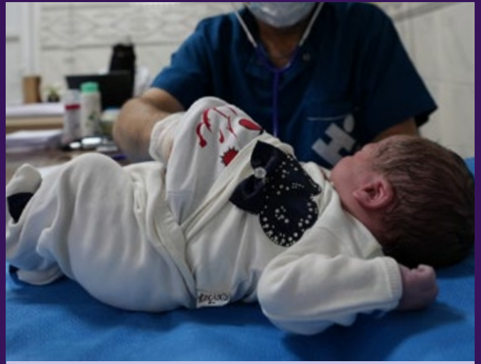
Baby's health being checked at Al Imaan.

The mobile clinic operated by Human Appeal in northwest Syria helped approximately 1,619 patients, offering diagnosis, treatment, and medicine, along with specialised care for malnutrition and gynaecological issues.