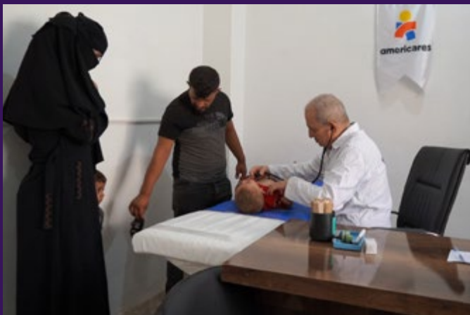
Child being examined at the Al-Zohoor clinic.

Human Appeal's Al Imaan Hospital in Syria provided medical care to 11,002 people over the month of July, delivering 354 babies via conventional birth and performing 73 C-sections.