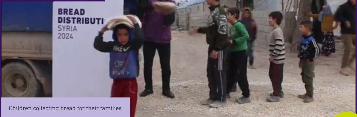
Children collecting bread for their families.