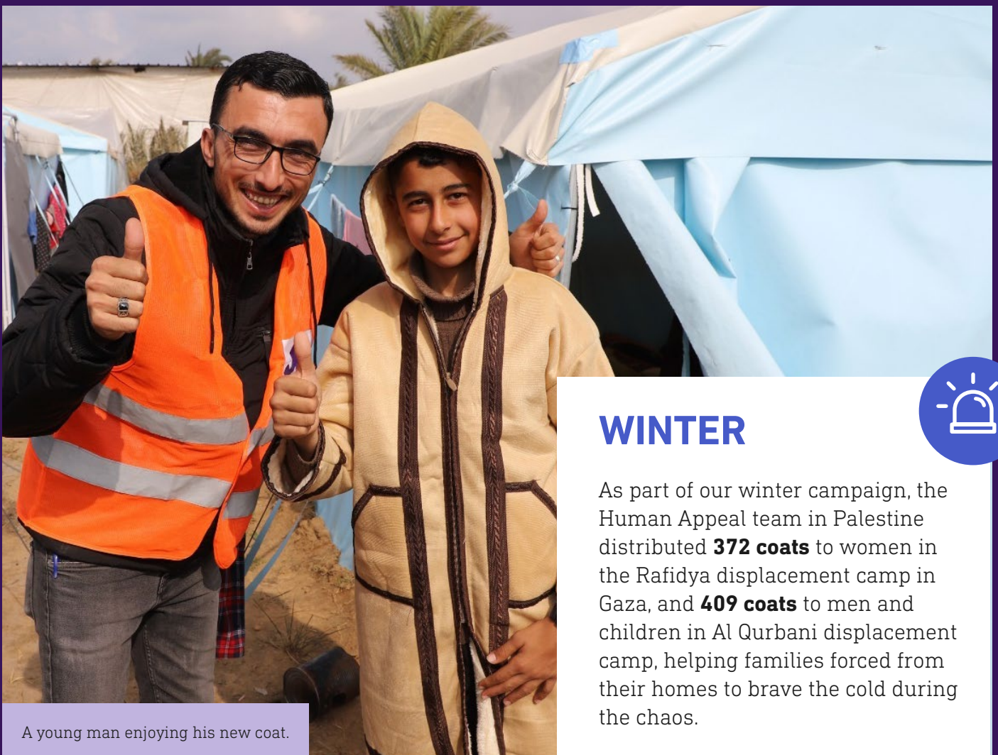
A young man enjoying his new coat.

In early February, the Human Appeal team worked with the Jordan Hashemite Charitable Organisation to inspect and quality check a warehouse full of medical supplies that was later sent to Gaza in two planes. This shipment was vitally needed, as medical facilities in Gaza are severely overstretched and short of supplies.