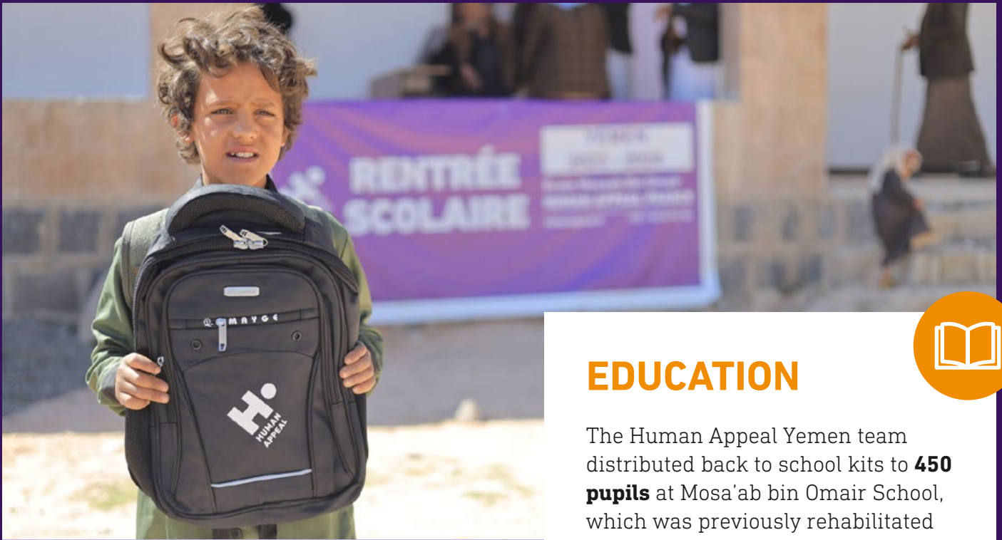
Pupil holding the rucksack containing the back to school kit.