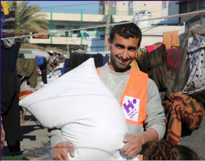
Human Appeal staff holding a bag of flour.