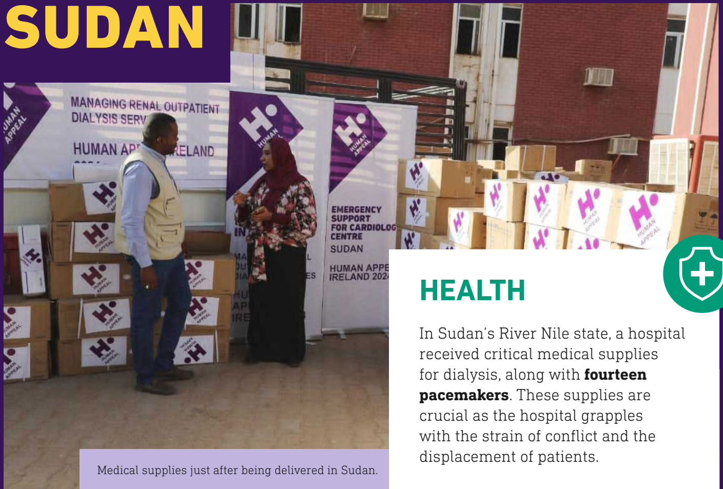
Medical supplies just after being delivered in Sudan.