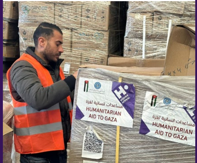
Staff checking medical supply boxes.

Through our partnership with JHCO, we swiftly provided vital medical supplies and medication to Al Awda Hospital in southern Gaza. Our support aims to help the hospital save lives during these turbulent times.