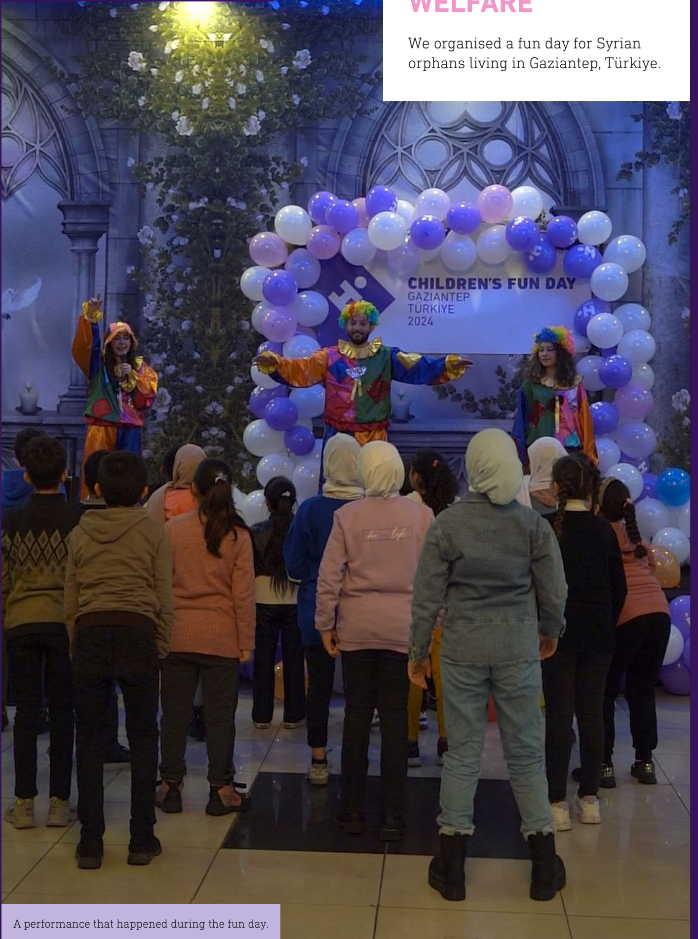
A performance that happened during the fun day.

We organised a fun day for Syrian orphans living in Gaziantep, Türkiye.