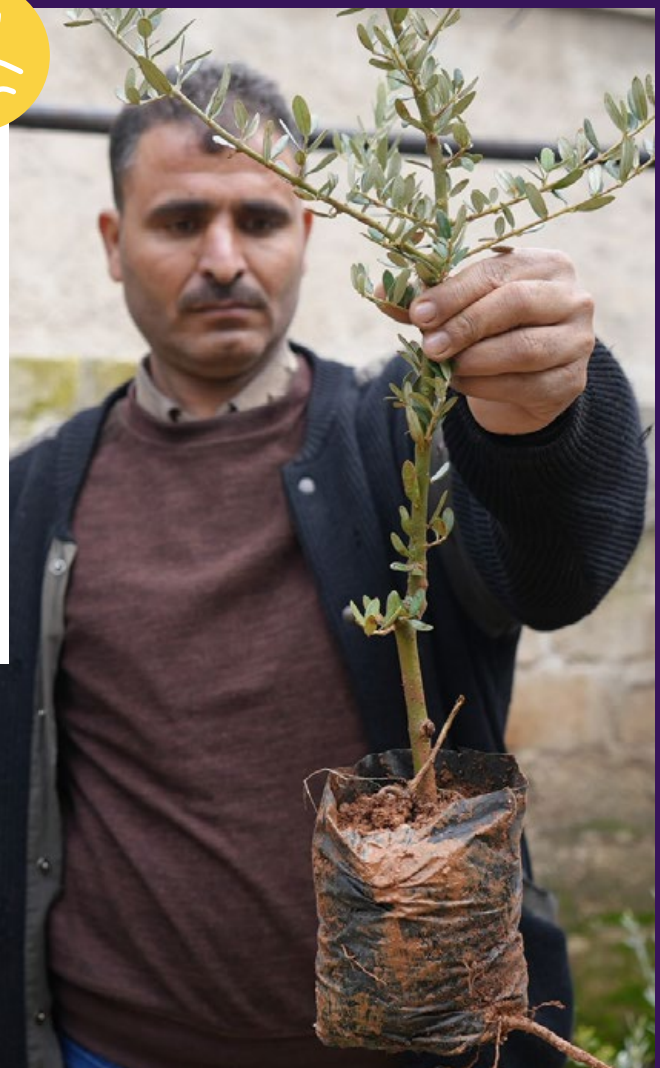
Farmer holding olive tree sapling.

Our Human Appeal team initiated the distribution of 52,500 olive tree saplings across multiple regions northwestern Syria. This endeavour seeks to enhance the circumstances of approximately 1,050 farmers by supplying each with about 50 saplings . Additionally, farmers will receive training on olive tree planting and care. This initiative not only offers farmers opportunities to enhance their livelihoods but also bolsters the local economy.