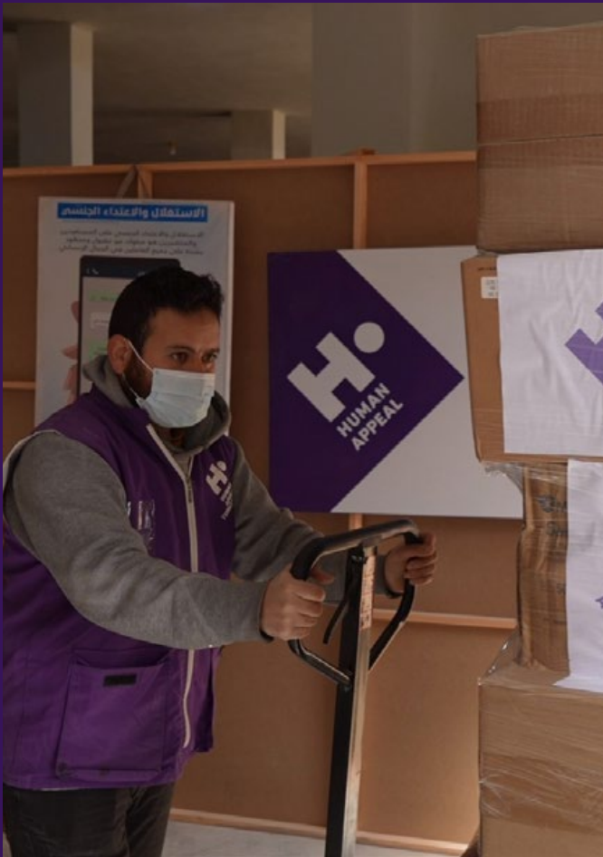
Medical supplies being arranged in a warehouse.

We distributed medical supplies provided by Globus Relief to forty medical centres in northwestern Syria, including mobile clinics, dialysis centres, surgical hospitals, and more. These helped to support hospitals facing severe shortages of medical supplies due to the chronic need for healthcare in the region, and the limited means the health centres have to access medical supplies.