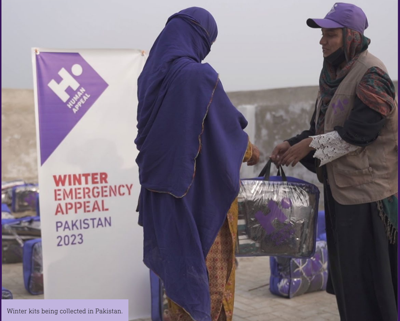
Winter kits being collected in Pakistan.

We've distributed 446 winter kits to families enduring the aftermath of the 2022 floods. Each kit includes two warm blankets, two sweaters, four pairs of socks, and four warm caps , providing essential warmth during the winter months.