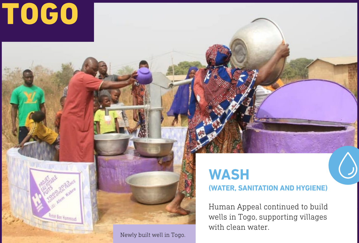
Newly built well in Togo.