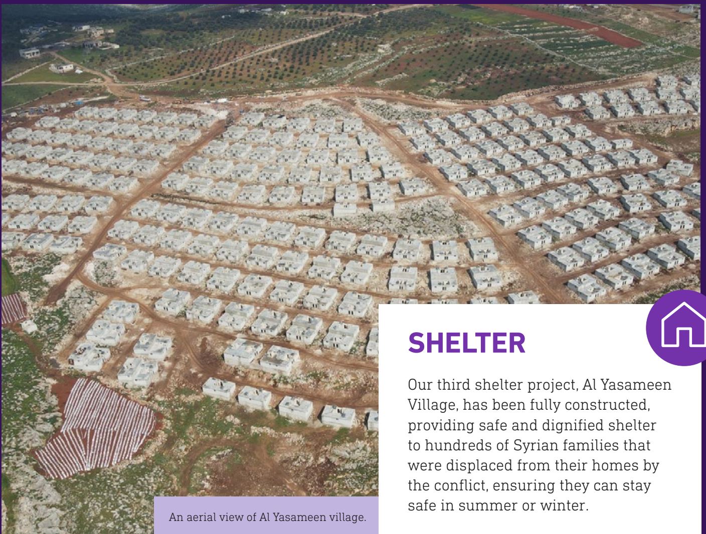
An aerial view of Al Yasameen village.