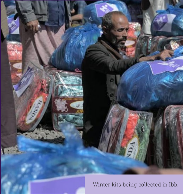
Winter kits being collected in Ibb.