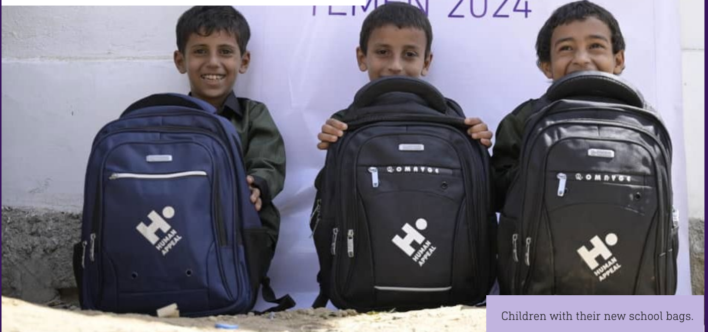
Children with their new school bags.