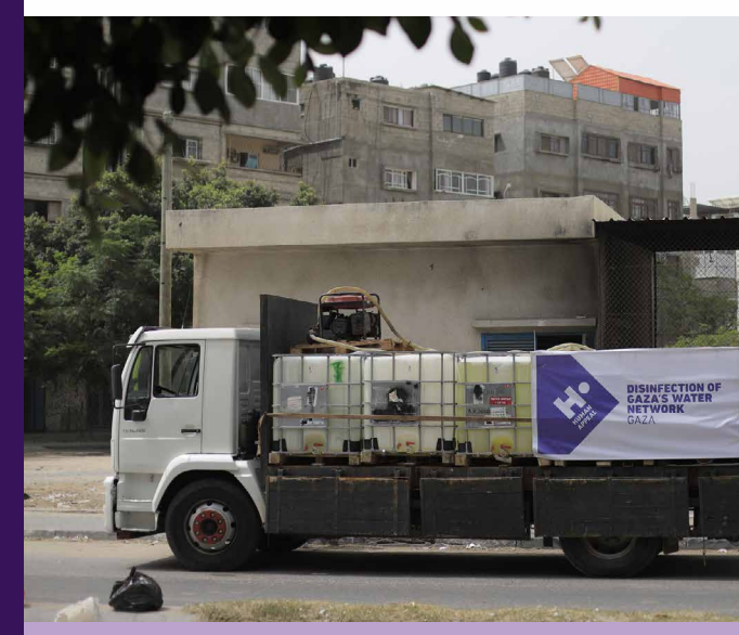
Truck carrying disinfectant materials.

We distributed over £40,000 worth of medicine and medical disposables to hospitals across Gaza to help them keep their services running following the violence in May, which badly stretched already limited medical supplies.