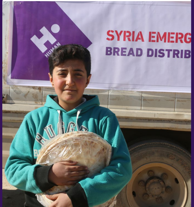
We are distributing thousands of bundles of bread in Syria.

Throughout May, we continued our bread distributions, providing 4,600 bundles per day to 2,300 families in northern Syria.