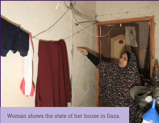
Woman shows the state of her house in Gaza.