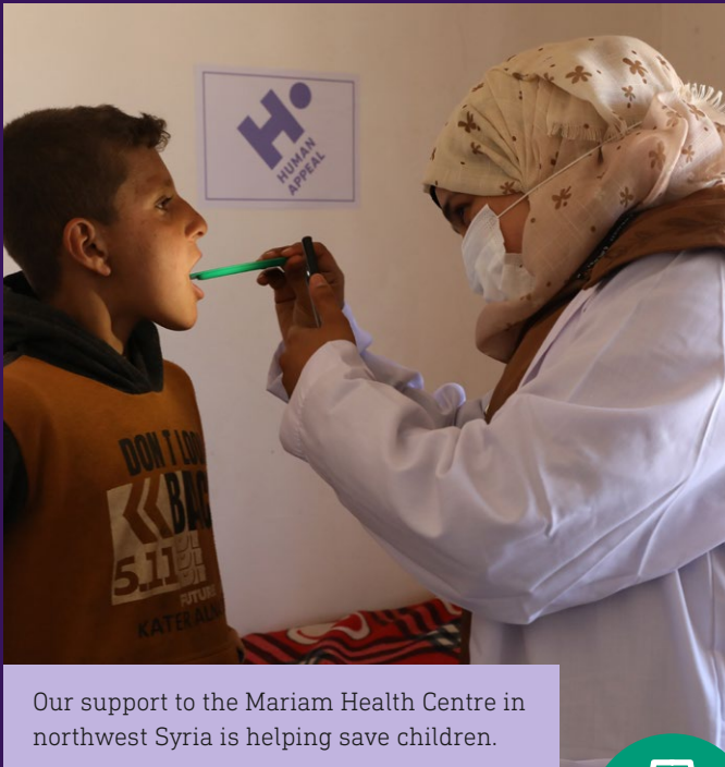
Our support to the Mariam Health Centre in northwest Syria is helping save children.