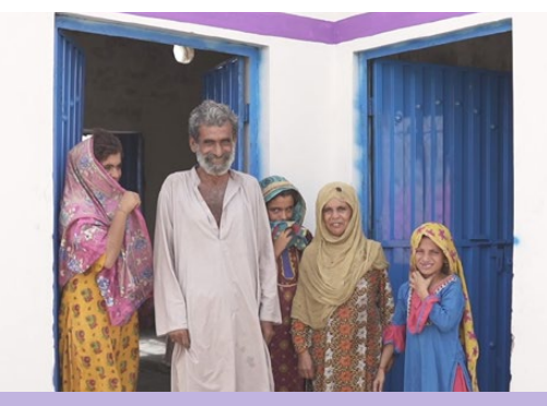
A family filled with joy after moving in to their new home.

In the village of Ghulam Hussain Chandio, we have successfully built 28 homes for families that lost their homes in last year's floods as part of Phase 1 of our housing project. These resilient homes are built six-feet above ground level, and are a testament to our commitment to safeguarding against future flooding. Our aim is to complete 250 homes in the near future with your help.