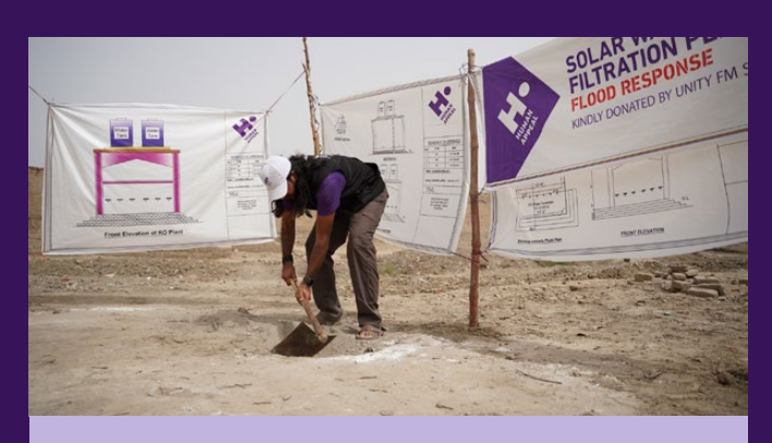
Breaking ground at one of the sites for the water plants.

Human Appeal has broken ground on a project to build 100 two-bedroom homes in Dadu in the Sindh Province. Each home will be built 5 feet above groundlevel, with bricks and steel girders. These homes are designed to enhance flood resilience and offer lasting shelter.