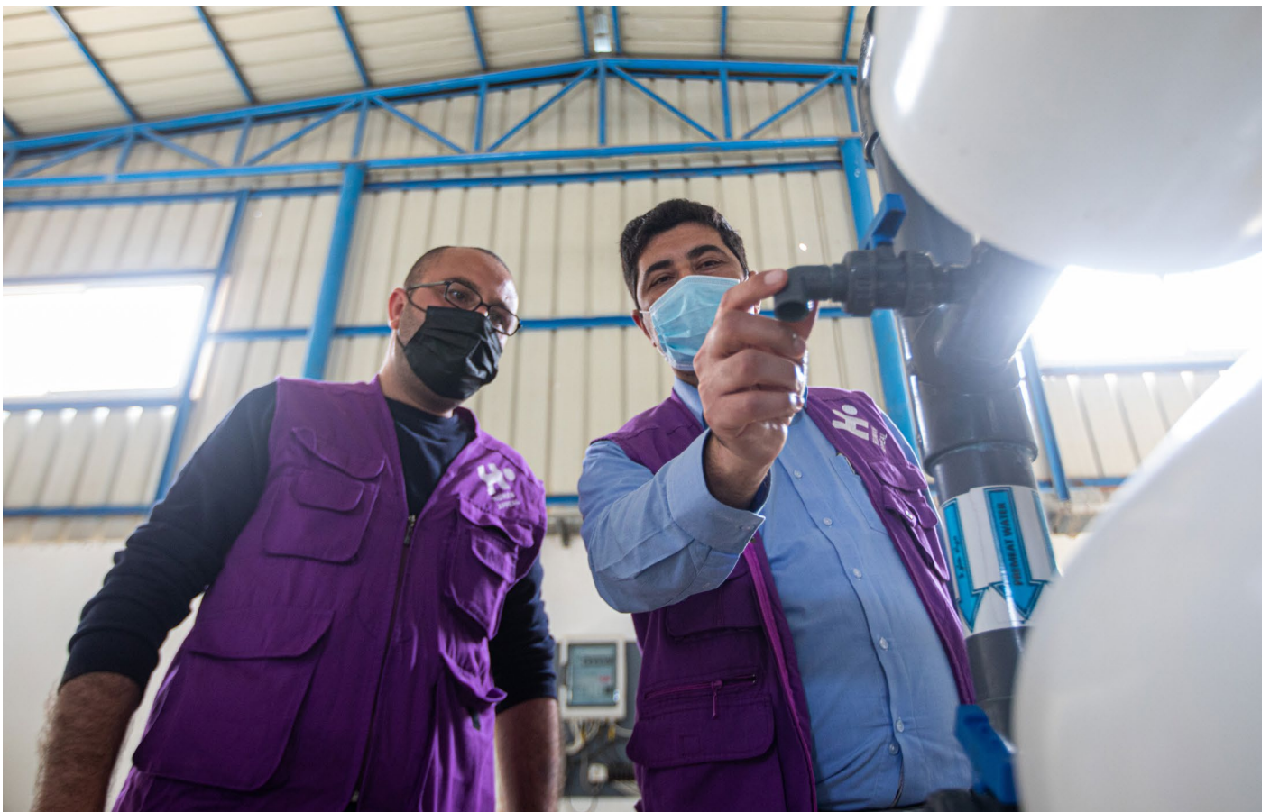
We're working on a desalination plant in Rafah, which will provide safe, clean water to 60,000 people!

By supporting Human Appeal's water projects in Gaza, you help us to save and preserve lives by providing clean water in a region where it's incredibly hard to access.