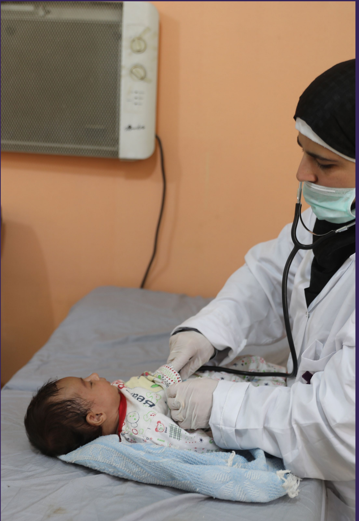
On average, our Al-Imaan hospital treats 4,000 people per month including babies and pregnant women.