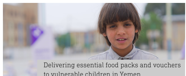
Delivering essential food packs and vouchers to vulnerable children in Yemen

This Eid, I'm looking forward to being able to spread relief through our Eid al-Fitr projects. I wish everyone could spend Eid with food on their table, never having to worry about their children sleeping hungry. Inshallah, together we can make that a reality one day.