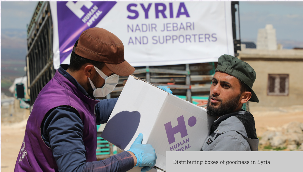
Distributing boxes of goodness in Syria