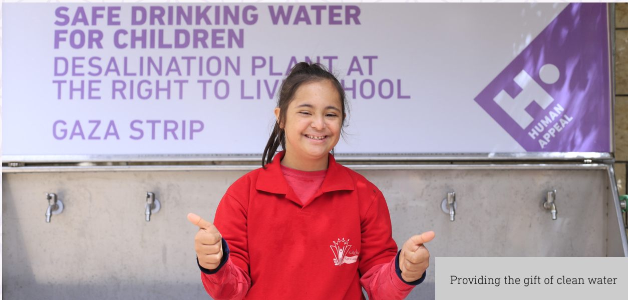
Providing the gift of clean water

We're also responding to the recent escalations in Palestine, distributing food to injured people, and medicine to hospitals treating casualties.