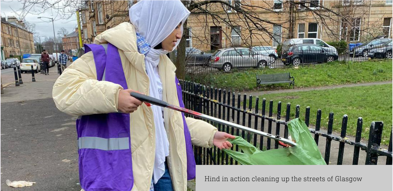
Hind in action cleaning up the streets of Glasgow