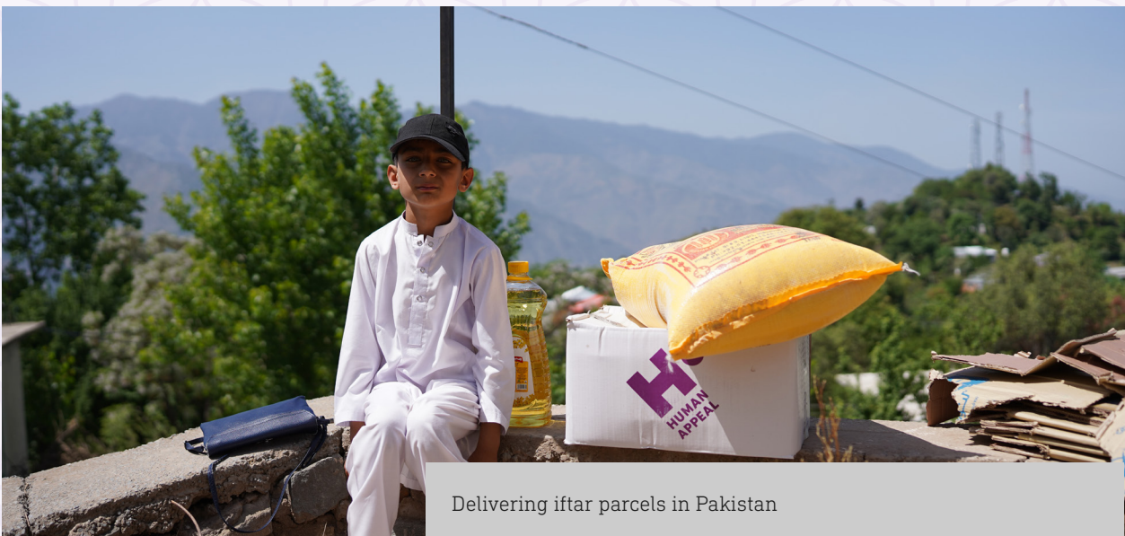
Delivering iftar parcels in Pakistan

Keep an eye on our social media platforms and newsletter for all the latest updates from our Feed the Fasting campaign.