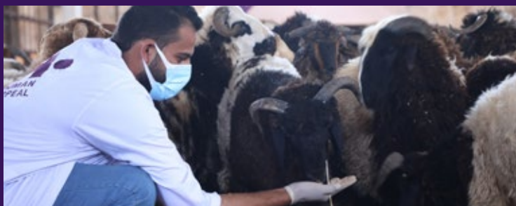
Our team in Syria checking in on the animals to be sacrificed during Eid - Al - Adha.

In Syria, medical supplies are scarce. Delivering them is a vital service we collaborated with Globus Relief to provide.