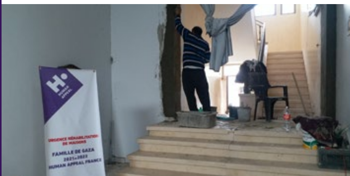
Workmen renovating one of the houses damaged in last May's escalation.

In June, we finished renovating around 80 homes that were deteriorated or damaged in the recent escalation, helping an estimated 480 people with a roof over their heads.