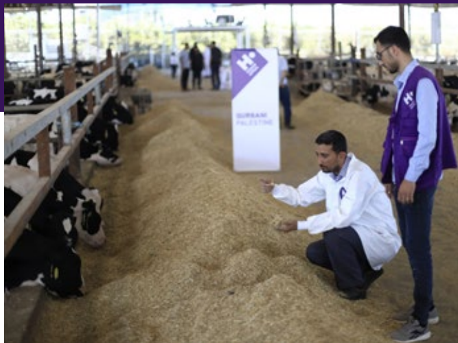
A vet checks the health of animals for Qurbani in Palestine.

Our teams visited local farms to ensure all animals are in the best condition for Qurbani. We plan to distribute Qurbani meat to 4,800 people in the Gaza Strip, with each family receiving 2.5kg of fresh meat.