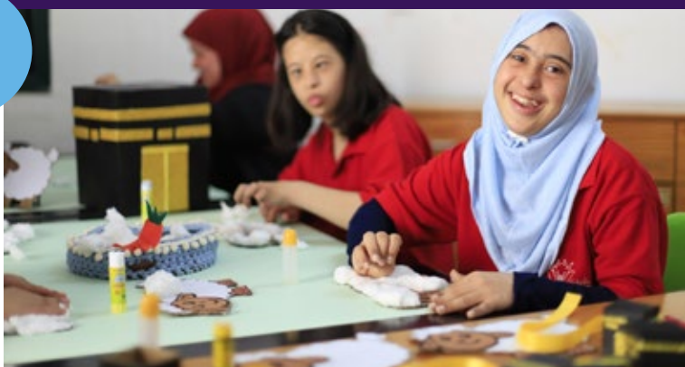
Children at the Right to Live Society making decorations for Eid.