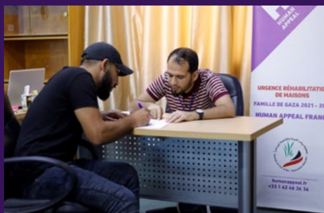
Finalising the secure payment to those affected.