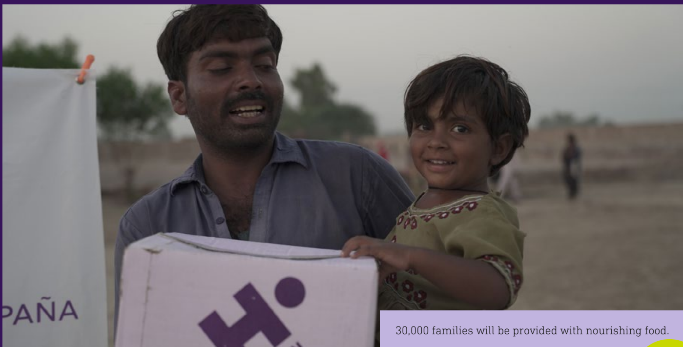
30,000 families will be provided with nourishing food.