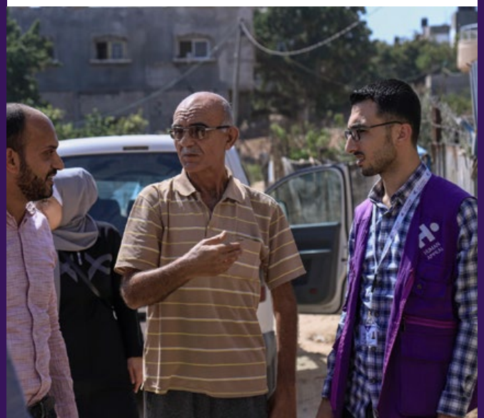
Consulting with locals is important before larger projects begin.

In preparation for a project to treat wastewater in the north of Gaza, our team visited the area to map it ahead of the project beginning.