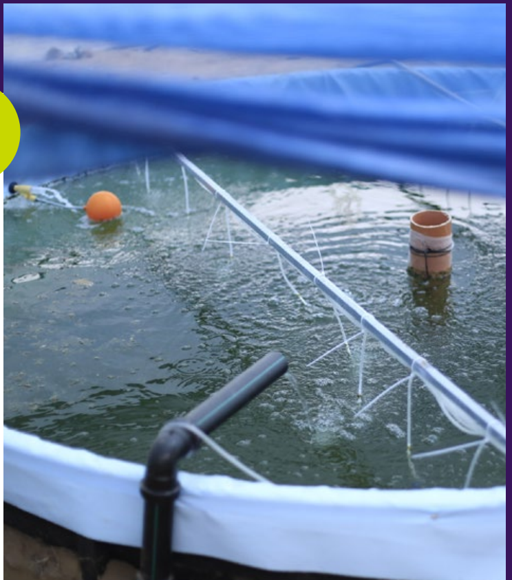
Aquaponics will help Palestinians agricultural efforts.

We're supporting 120 agronomy students with nexgen agriculture techniques to create sustainable livelihoods in Gaza, where the blockade and water scarcity have made traditional farming incredibly difficult. Aquaponics reduces the water requirements for typical agricultural products by leveraging the natural symbiosis between plants and fish. This innovative farming practice equips vulnerable families in Gaza with the skills needed to profitably grow food to feed themselves and their families.