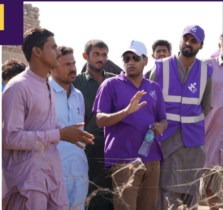
Conversation with residents to see what they need.

Human Appeal Pakistan team visited a flood-hit village in the Dadu District of Sindh, to assess the damage and determine the best ways to help meet survivors' needs. The team met with locals to discuss the planning for new home construction for residents who are now forced to live on the roads.